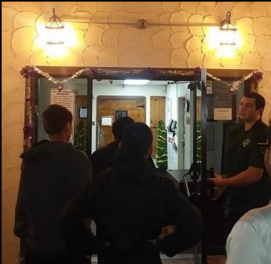
Youth and CSR Staff Arrive at Windsor Mission Oaks Nursing Home

The project finale included a Reading Circle Presentation and Gifting where our youth visited elementary grade level children at the San Juan Community Center. Project youth read their money management books to the kids. Then presented them with handmade activity books and coloring supplies as gifts.