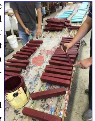
Painting — A Favorite Part of Cart Assembly

To learn more about the PET® Mobility Project, please go to http://petinternational.org/ ■