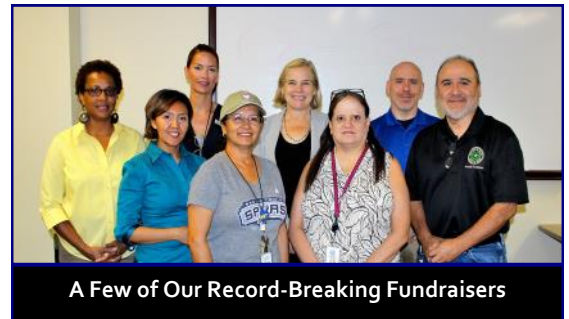
A Few of Our Record-Breaking Fundraisers