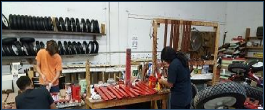
Youth Assembling and Painting Cart Parts (June 22, 2016)

To learn more about the PET® Mobility Project, please go to http://petinternational.org/ ■