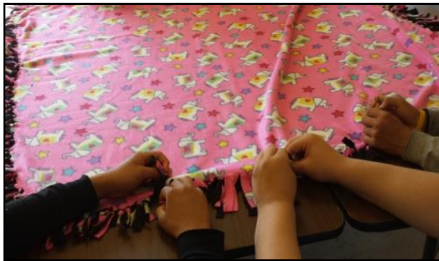
Our Youth Making Blankets for Homeless Children

Global Youth Service Day (GYSD) is an annual campaign that celebrates the millions of children and youth who improve their communities each day of the year through community service. Established in 1988 as National Youth Service Day in the United States, and expanded globally in 2000, Global Youth Service Day is the largest service event in the world. It is now celebrated in over 100 countries. In Texas, it is celebrated the entire month of April. The Texas Juvenile Justice Department is the lead agency in the state. Bexar County Juvenile Probation Department's participation in this event dates back to 1991.