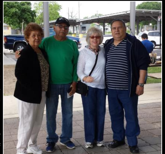
Seniors Drop Off Their Lawnmowers at the Frank Garrett Center

For questions, comments or suggestions on this newsletter, please contact: