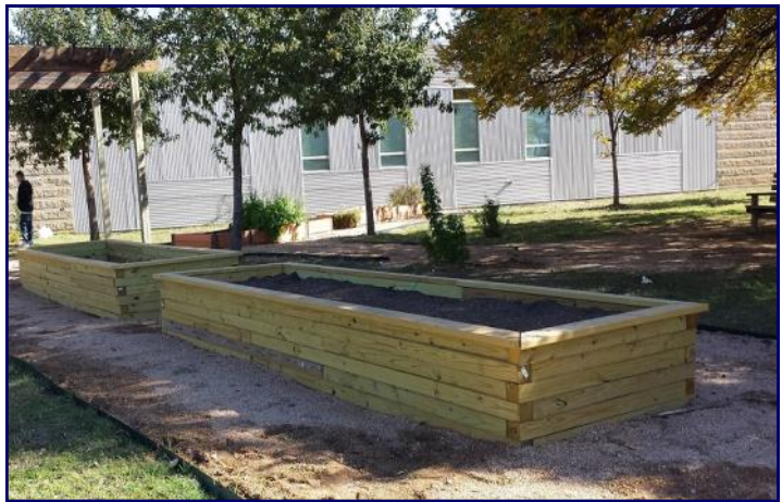
Refurbished Raised Beds

On September 20 th , an upgrade of the community garden was started. The process entailed reconstructing eight raised beds, new plantings, and infill of decomposed granite. This work crew project was completed on December 6 th . It was led by CSR Specialists Andrew Ramos and Joe Medellin. The new raised beds look great. ■