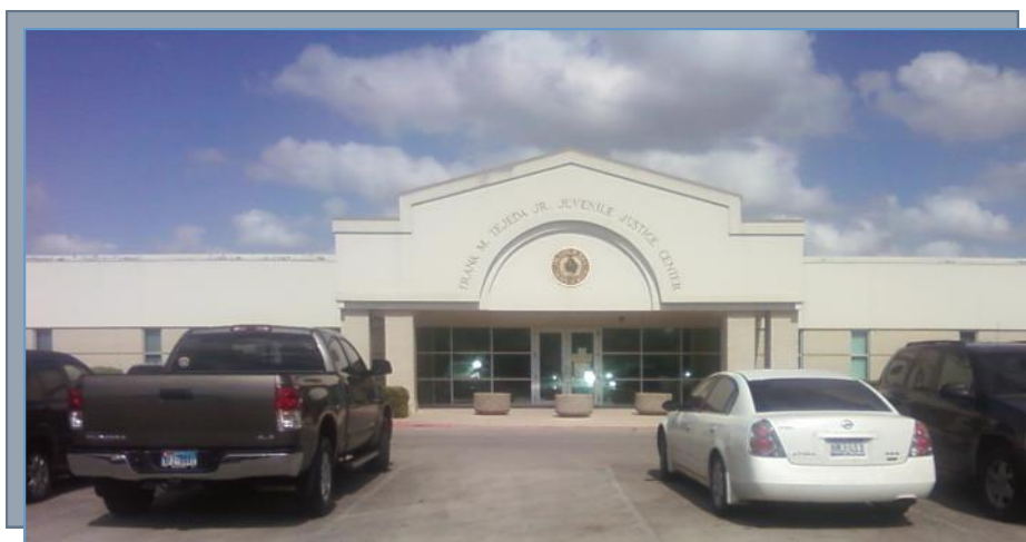
CSR Unit located at 235 E. Mitchell, San Antonio, Texas (Frank Tejeda Juvenile Justice Center)

Please share any comments, suggestions or thoughts you may have that will help us provide you with relevant information. We will make every effort to accommodate your request.