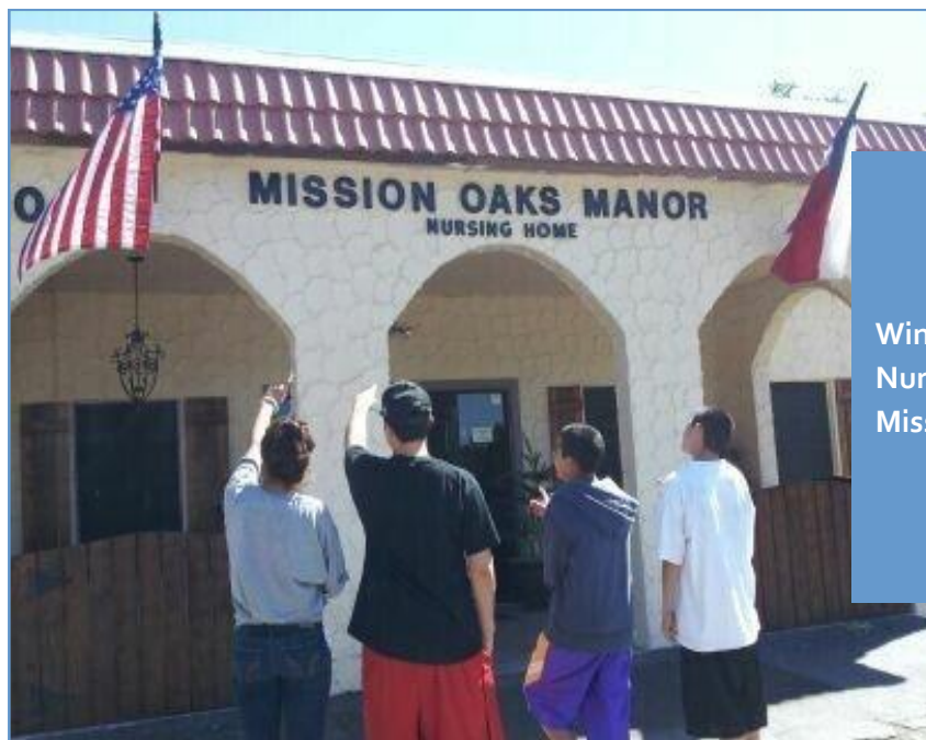
Windsor Mission Oaks Nursing Home (formerly Mission Oaks Manor) .