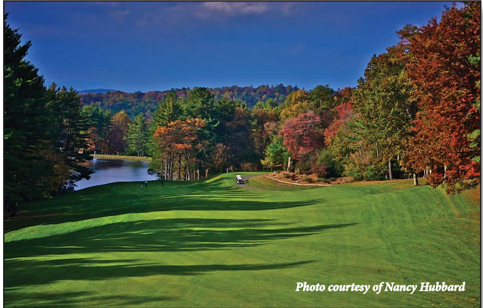
Par-4 12th hole with views of the lake and mountains SW Virginia

High Meadows golf facilities include a driving range, putting green, practice sand bunker and chipping area. High Meadows also hosts golf outings and programs for seniors, women, men, couples and an upbeat juniors program.