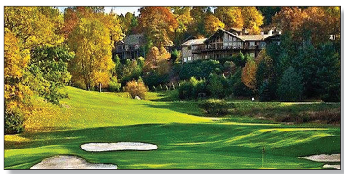
Classic mountain homes have a birdseye view of the par-4 10th hole at High Meadows Country Club

High Meadows offers a full service food and beverage department which is the heart of their dining and social commitment to their members and friends. Executive Chef Nicole Burrell and her staff offer everything from breakfast, light snacks and burgers at the Hummingbird Grille to all your favorite and current adult beverages at the Side Door Lounge. As well as casual to elegant dining in one of the two main dining rooms, the Dogwood or Redbud rooms, both with magnificent sweeping views of the 1st and 18th holes.