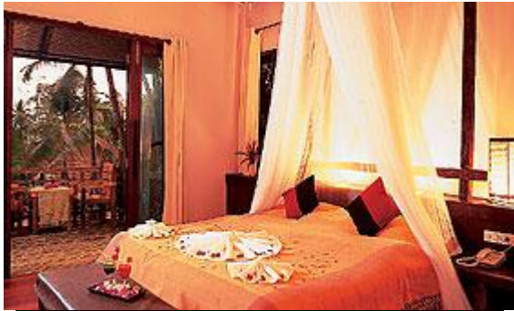
Upper Hill Cottage

On top storey of a building with a width room (size 45 square meters), including back and front balconies with a double bed suitable for a couple.