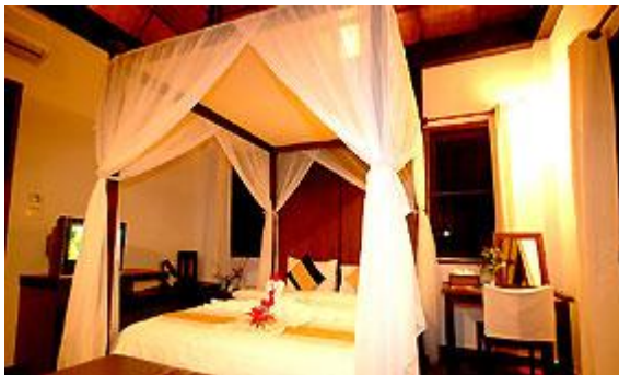
Single Hill Cottage

A single villa located at the base of a little slope close to the center in area 40 sqm well designed with a double bed suitable for a couple, each room comes with air condition, refrigerator, 21T.V., DVD player, Bath tub, hair dryer, complimentary Tea maker, safe deposit, Bath robe, slippers and bath room amenities with big balcony in front of the room.