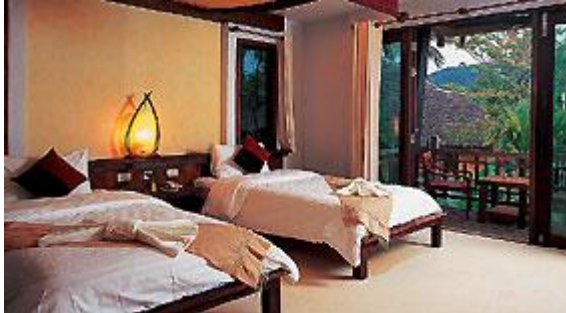
Lower Hill Cottage