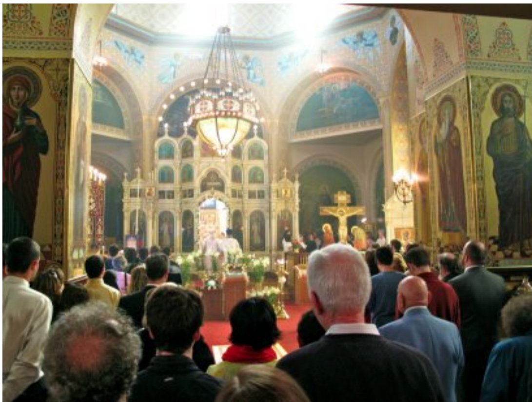
Interior of Chicago's historic Holy Trinity Cathedral.

The 125th anniversary of Chicago's Holy Trinity Cathedral , slated to be celebrated June 10-11, 2017, will coincide with the 125th anniversary of Orthodox Christianity in Chicago.