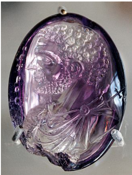
Roman intaglio engraved gem of Caracalla in amethyst, once in the Treasury of Sainte-Chapelle .

Amethyst was used as a gemstone by the ancient Egyptians and was largely employed in antiquity for intaglio engraved gems.