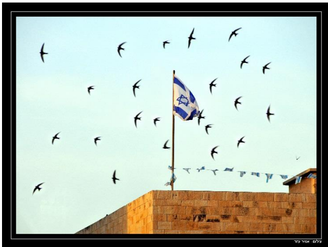
Israel, paradise for swifts and swift lovers

Registration should be no later than October 1 st 2017. Please note that the fee will be increased by 25% after November 30 th 2017.