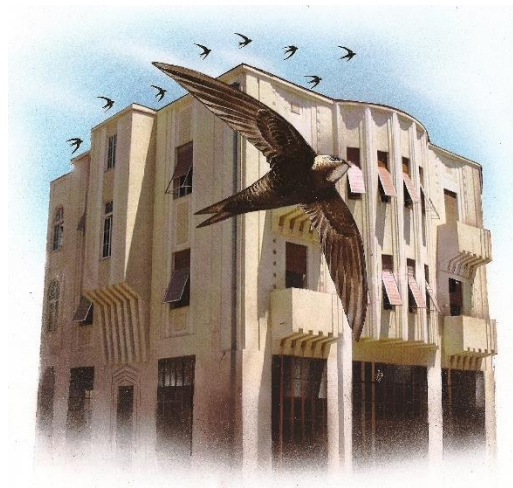
Schiff House in Tel Aviv, a heritage site with nesting swifts (Illustration: Tuvia Kurtz)