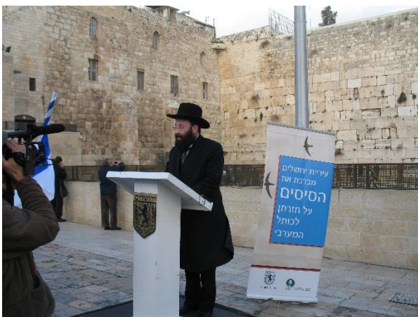
Welcoming ceremony for the swifts at the Western Wall in Jerusalem with Rabbi Shmuel Rabinowitz of the Western Wall