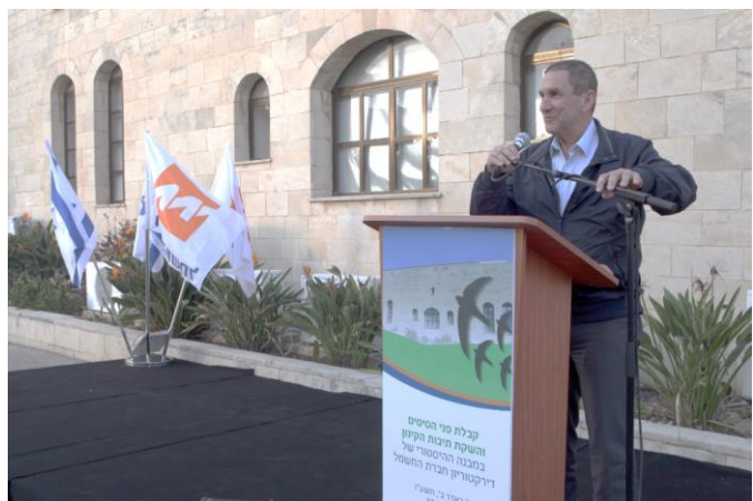
March 17 th 2016: inauguration ceremony of 36 nesting boxes for swifts at the Israel Electric Corporation (IEC) Directorate building