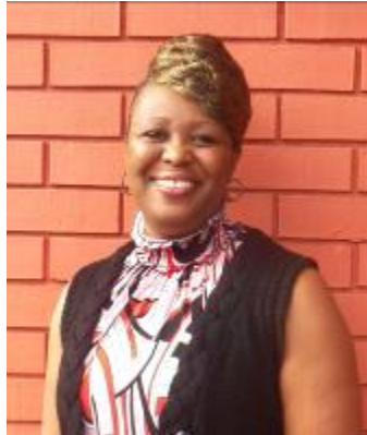
Elect Lady Ford Columnist