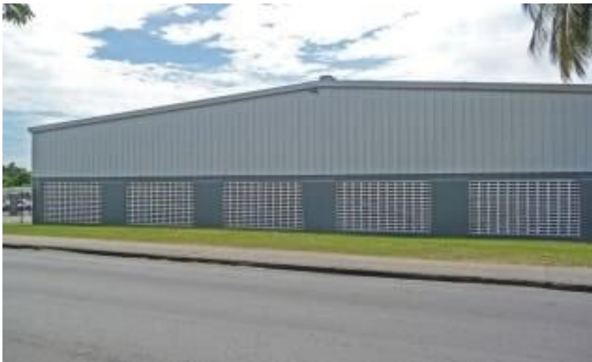
< A photo showing the side views of the property we are going to acquire >