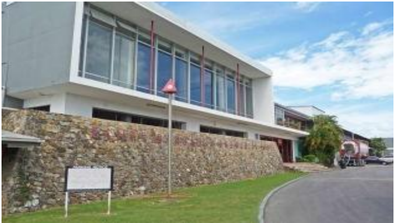
< A photo showing the side view of the property we are going to acquire >