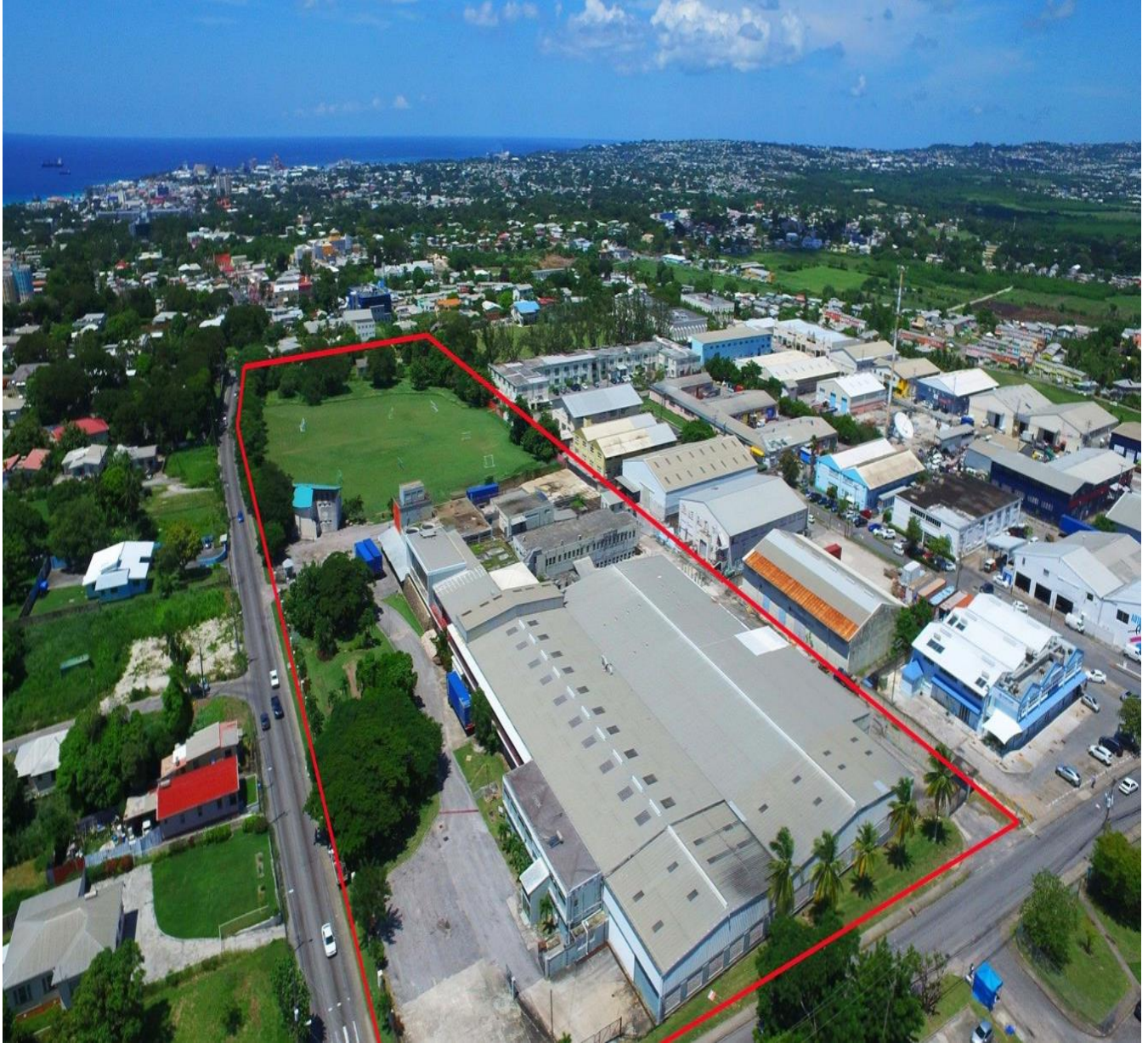
< A photo showing the outside view of the property we are going to acquire >