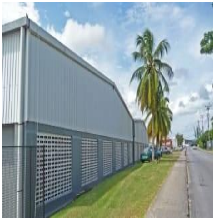
< A photo showing the side views of the property we are going to acquire >