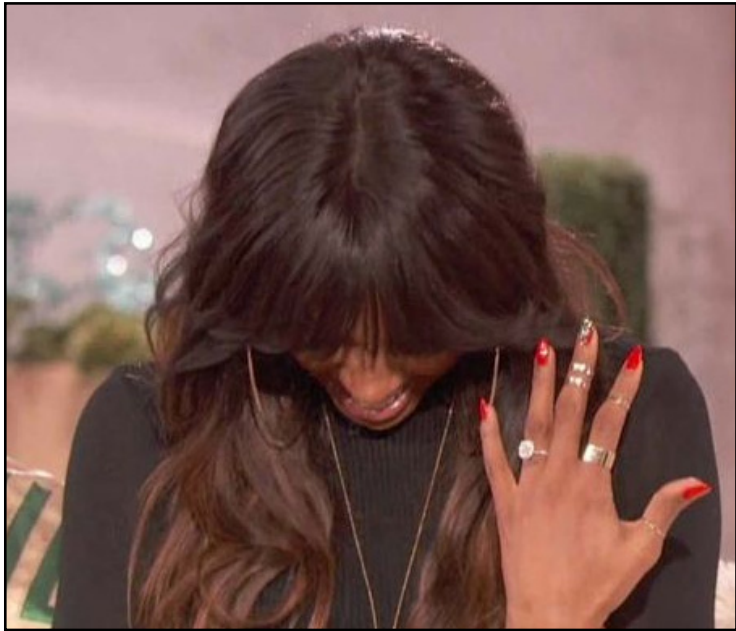
Kelly Rowland puts her head down and laughs as she shows off her engagement ring on Wednesday’s ‘Queen Latifah Show.’