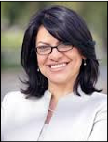
State Representative Rashida Taliab - 6th District

I look forward to another year of providing you with empowering information to help you improve yourself and our community. See you next week and Merry Christmas.