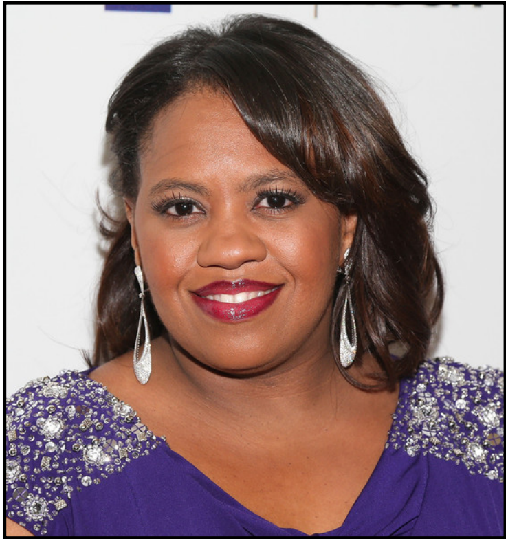
Actress Chandra Wilson attends NYU’s Tisch School Of The Arts’ West Coast Benefit Gala at Regent Beverly Wilshire Hotel on October 28, 2013 in Beverly Hills

Chandra Wilson of ABC’s “Grey’s Anatomy” is due to scrub in on daytime soap “General Hospital” for a guest appearance.”