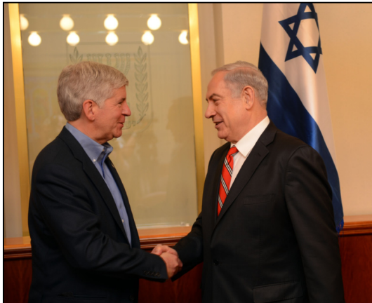
Gov. Rick Snyder, left, meets Israel Prime Minister Benjamin Netanyahu in Tel Aviv during his investment mission to Israel. The governor and prime minister discussed ways to increase trade and investment opportunities between Michigan and Israel.

to discuss trade, investment opportunities Letter of intent also signed to encourage industrial research