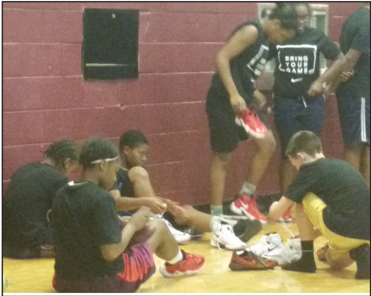
Kids lace up their LeBron James sneakers before hitting the court