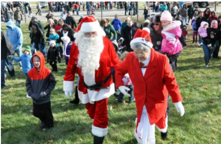
Santa and Mrs. Claus come to Taylor and kickoff the season

The City of Taylor, Downriver Fish & Loaves Food Pantry and the Taylor Conservatory & Botanical Gardens has scheduled a “Taylor Winter Festival Christmas Kickoff” for Saturday, November 28 at Heritage Park (Northline and Pardee roads).