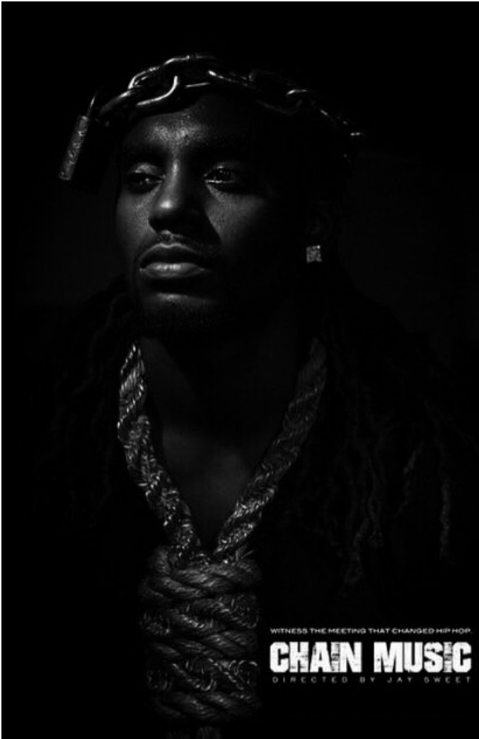
Chain Music uses entertainment to redirect youth