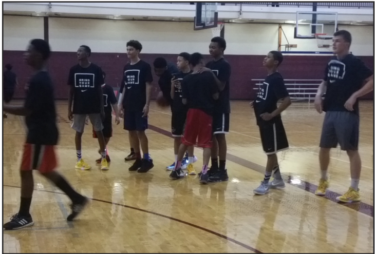
Youth warm ups before the clinic

IT'S TIME TO PUT OUR DOLLARS TO WORK IN OUR COMMUNITY. BECOME A PART OF OUR SMALL BUSINESS ROUND-UP! MARKET YOUR BUSINESS TO THE READERS AND SUPPORTERS OF THE TELEGRAM NEWSPAPER. ~~~~~ 313-928-2955