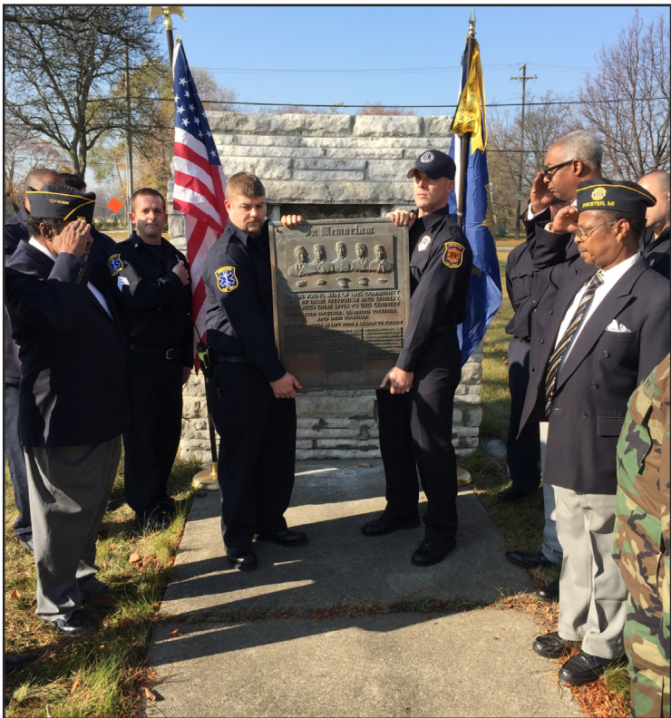
Firefighters display the 3 foot plaque that was removed from the old site at the old city hall

By Shelby Jefferson – Telegram Staff Reporter