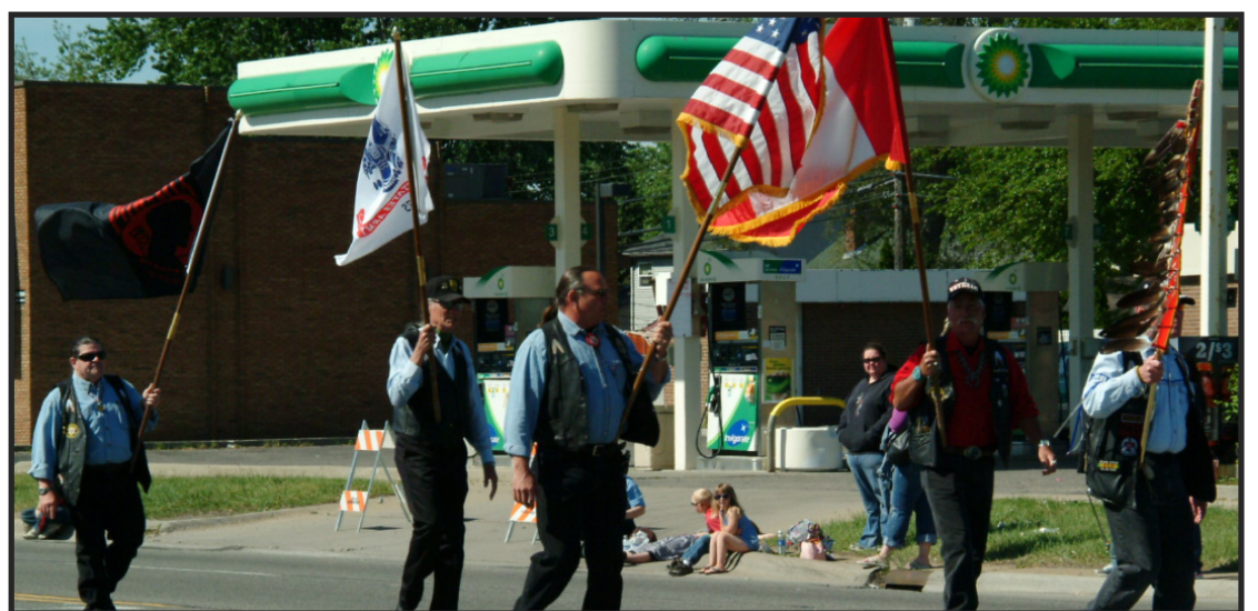
Native American Veterans Association of Southeastern Michigan (NAVASEMI) members march during a Vietnam veterans parade