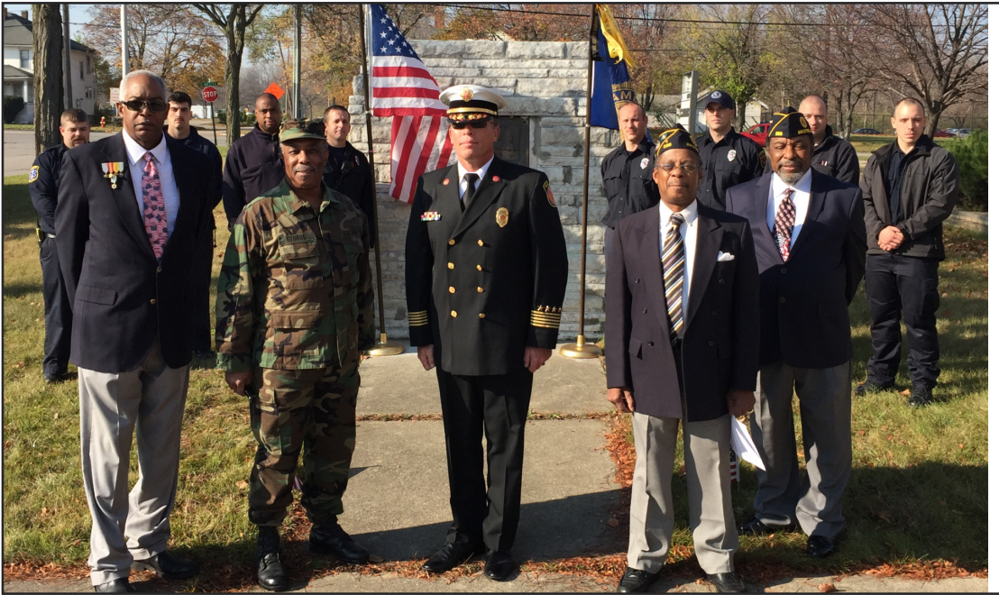
Participants stand at attention during the ceremony to give the veterans memorial a new home