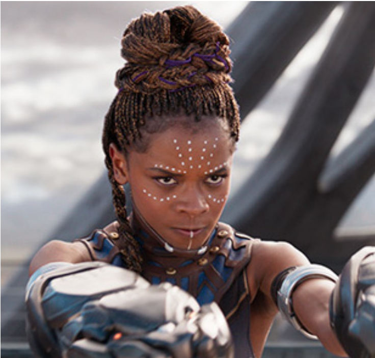
Princess Shuri uses technnology to win