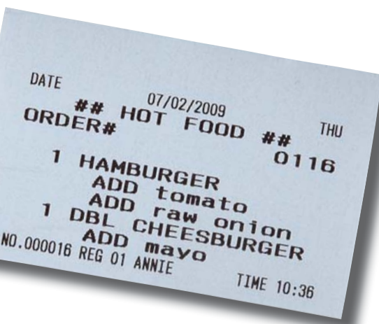
Kitchen requisition printed by the SPS-530 80mm receipt printer shown 75% actual size.