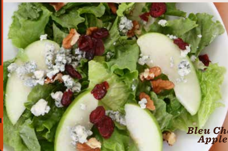
Bleu Cheese and Apple Salad

PALMETTO BANQUET ROOM AVAILABLE 864.507.4310