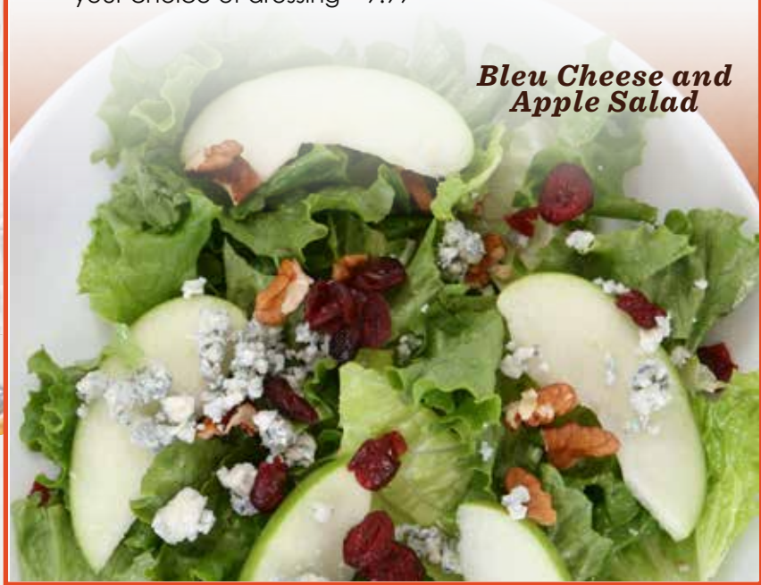
Bleu Cheese and Apple Salad

Romaine lettuce topped with tomato, cucumber, sliced avocado, mandarin orange and almonds with your choice of dressing – 9.99