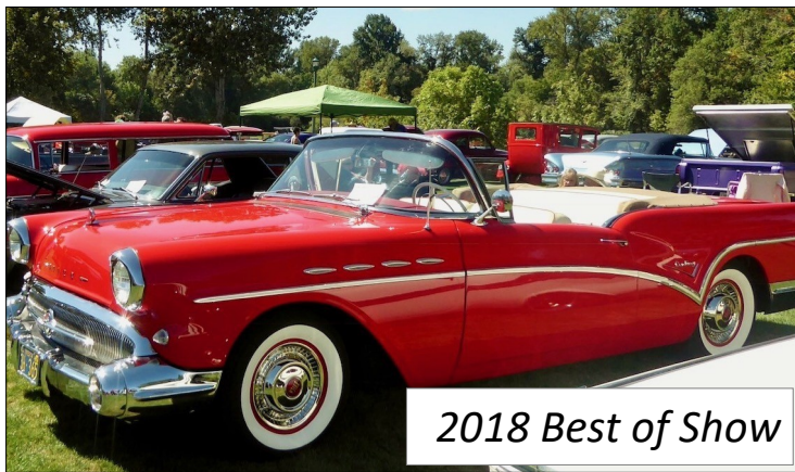
2018 Best of Show

101 FRONT ST. SALEM, OREGON 97301 Gate Opens at 7 A.M.