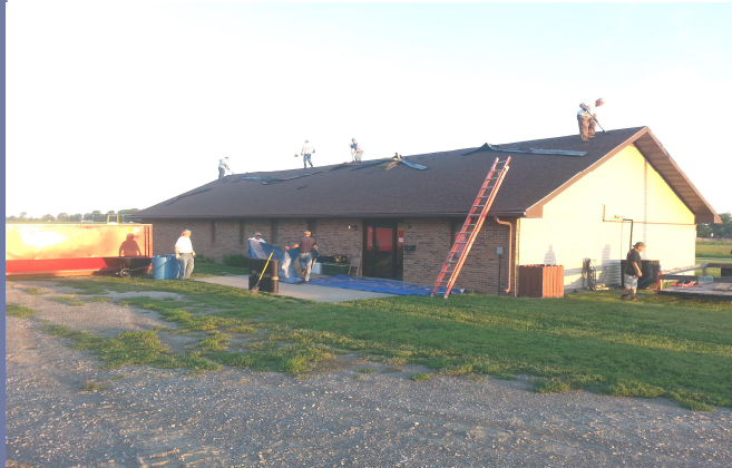
Roof project at 7:00 am on Friday, September 5