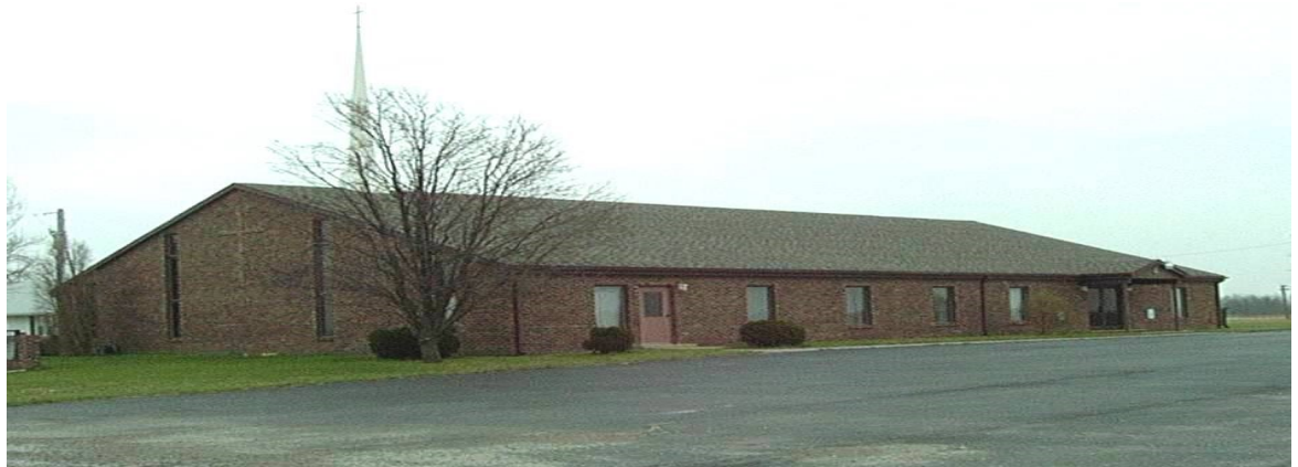
Camp Branch Baptist Church Anniversary 1877