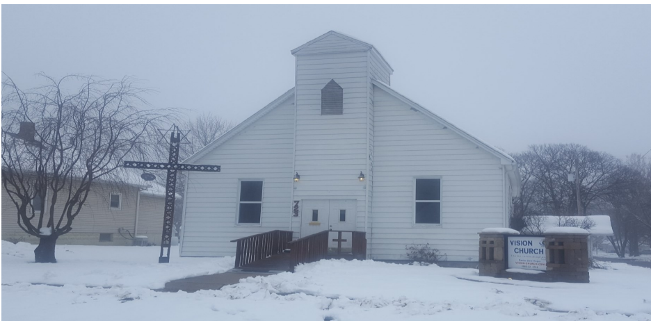
Vision Baptist Church Anniversary 2013