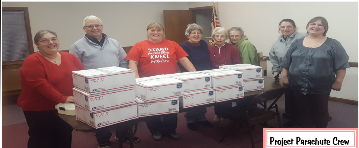
Project Parachute Crew