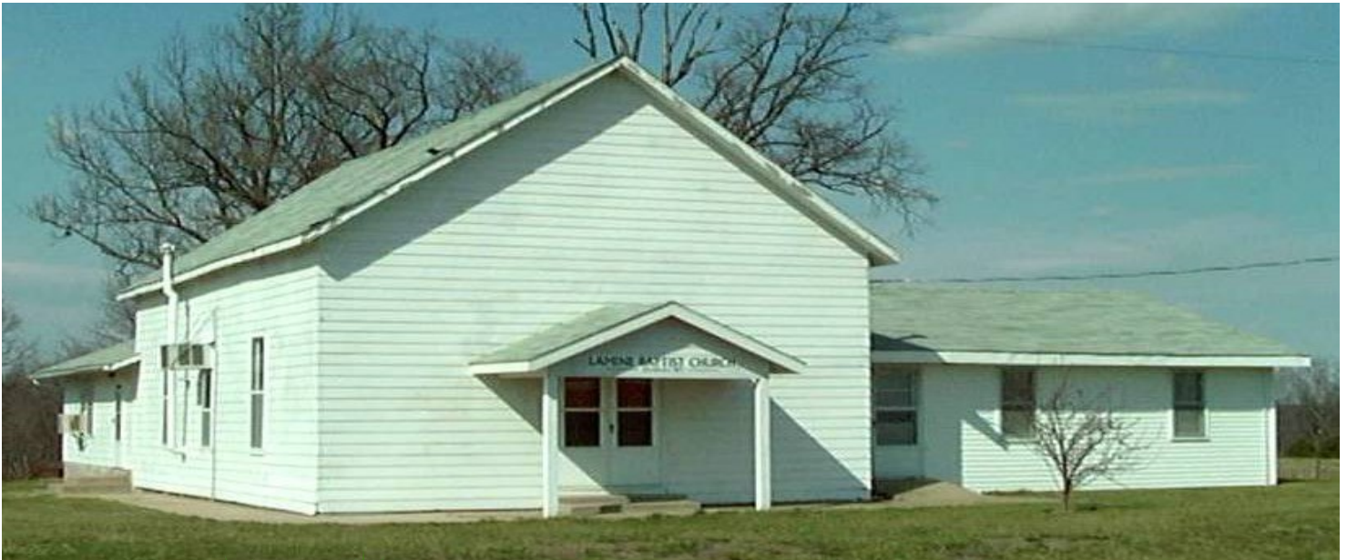
Lamine Baptist Church - Anniversary 1874