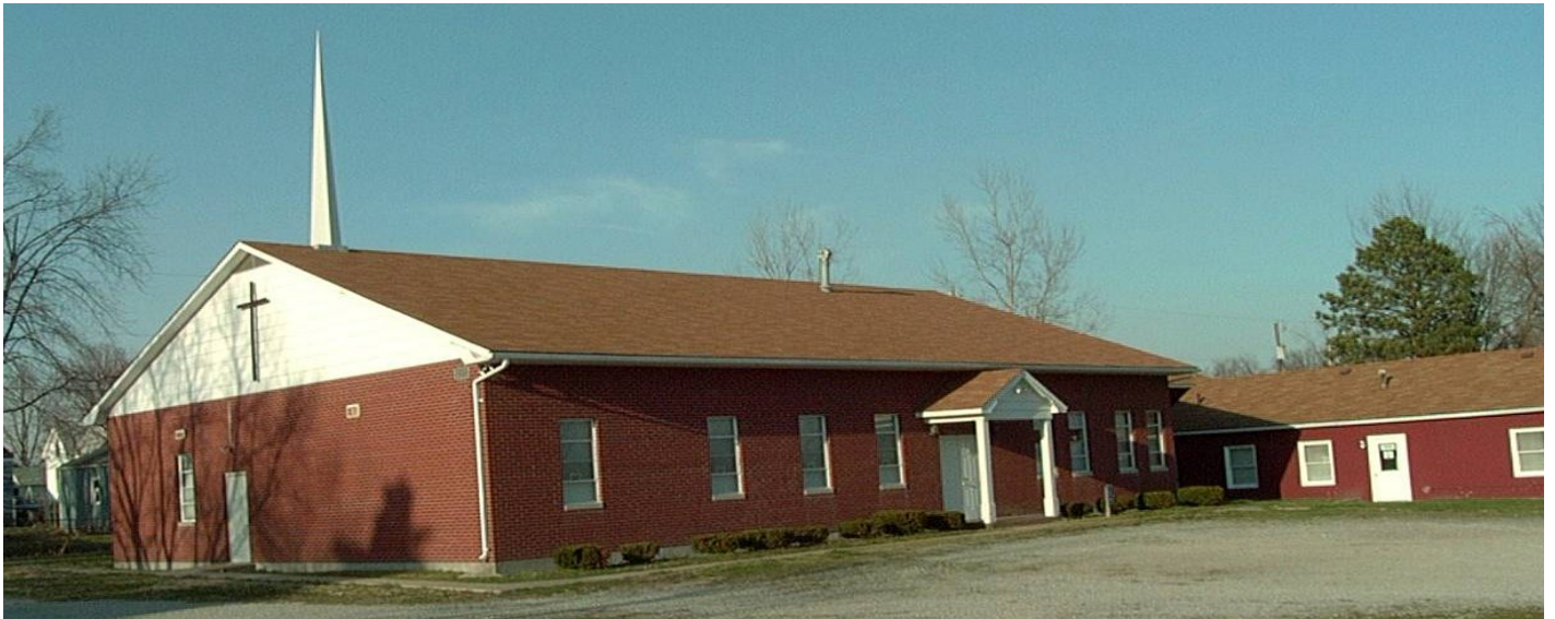
Broadway Baptist Church - Anniversary 1967