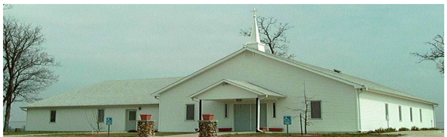
Hopewell Baptist Church Anniversary 1867