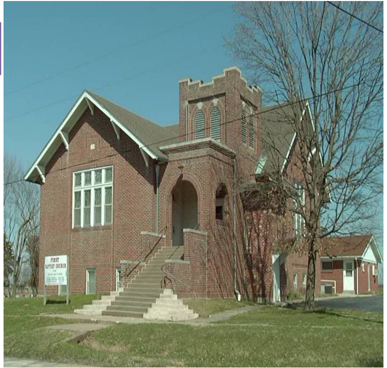
First Baptist Church of Syracuse is celebrating their 175th anniversary September 10th at 11:00 am.