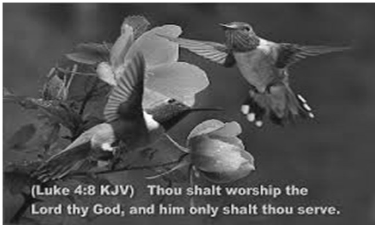
(Luke 4:8 KJV) Thou shalt worship the Lord thy God, and him only shalt thou serve.