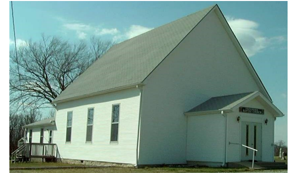
Providence Baptist Church Anniversary, April 4, 1842

2020 Monthly Requirement $7,511.27 Church receipts for March $5,145.03 Net Budget difference ($2,366.24)