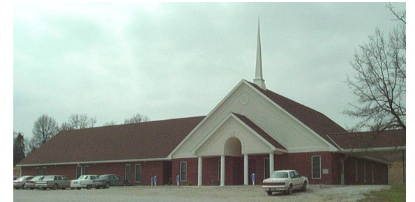
Olive Branch Baptist Church Anniversary, April 28, 1872