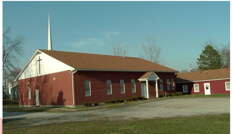
Broadway Baptist Church Anniversary 12/7/1966