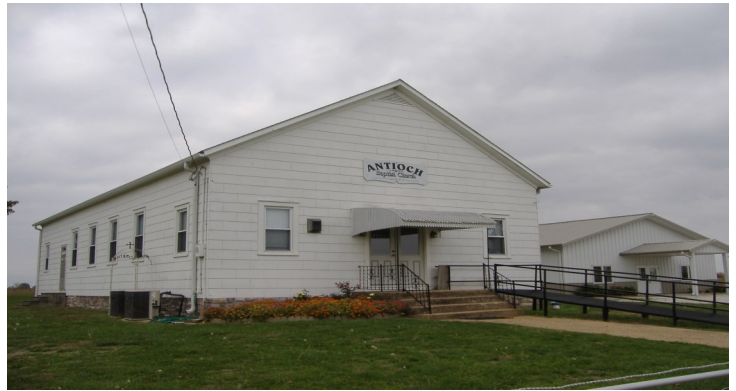
Antioch Baptist Church Anniversary 12/1868

2019 Monthly Requirement $7,190.92 Church receipts for November $6,216.54 Net Budget difference ($974.38)