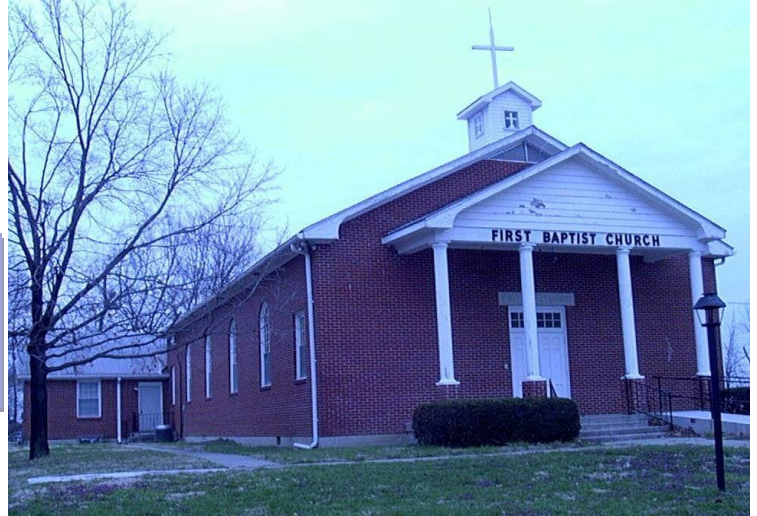
First Baptist Church of Houstonia Anniversary 10-14-1966

2019 Monthly Requirement $7,190.92 Church receipts for October $9,706.36 Net Budget difference $2,515.44