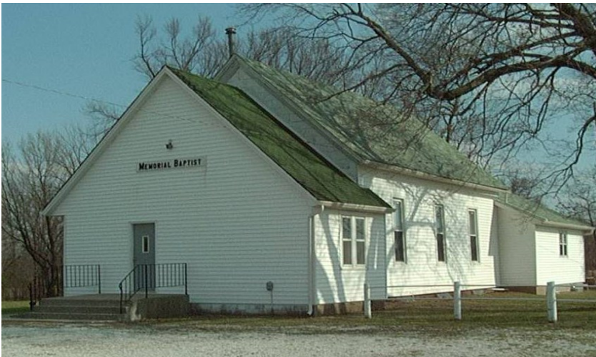
Memorial Baptist Church Anniversary - June 1892