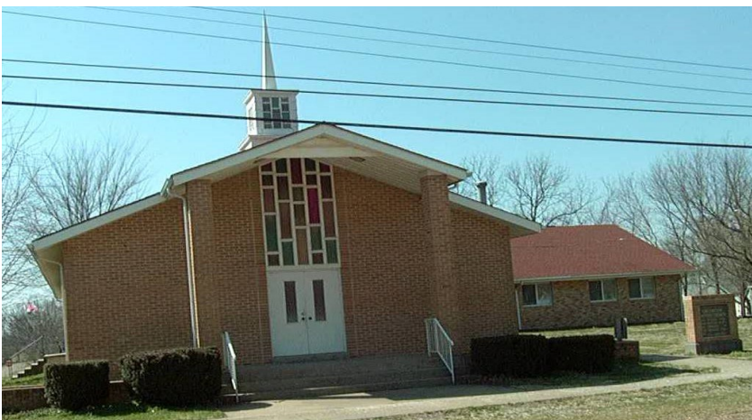
Smithton Baptist Church Anniversary - June 1865