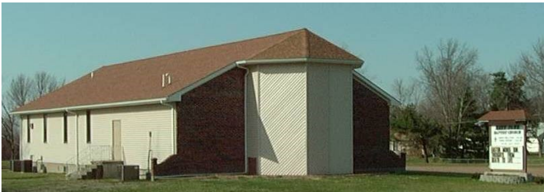
Katy Park Baptist Church Anniversary 5/19/85