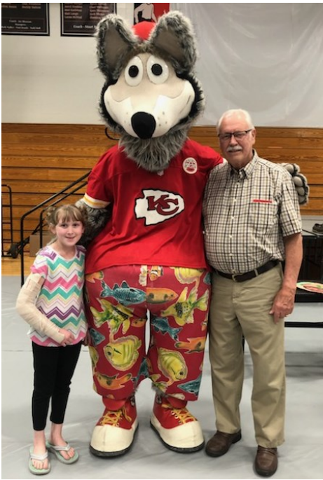
HAD A WONDERFUL VISIT WITH KC WOLF.

We need help with supplies for the kids at Kid's Kamp. They will be putting together bags for Haiti. They need supplies to fill these bags here is a list.