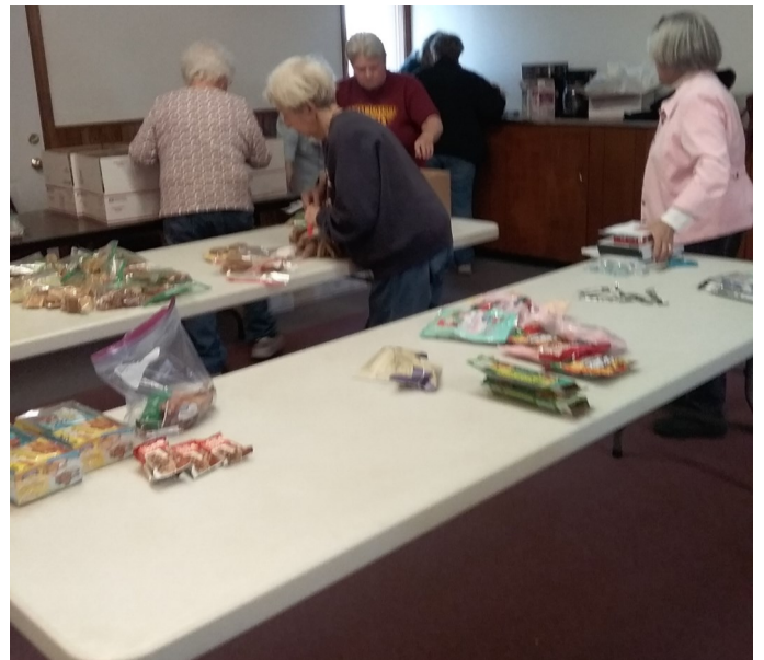
Project Parachute - Packing Easter Boxes.