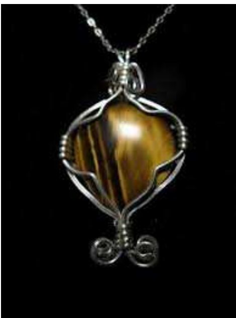
Photos: At left, Wire Wrap; top right, Viking Weave; bottom left, Pietersite Rough; bottom right, Chain Maille