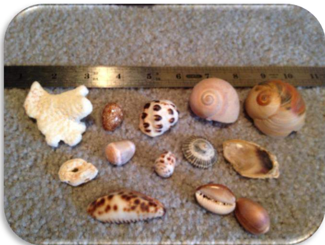
Below - These aren't rocks but shells from Kauai when it was legal to take them!

I've always been intrigued by "rocks." Every summer when I was a kid, my family took a vacation. My father always made sure it was educational. We always drove from home, Texas City, to visit grandma near Paris, Texas, then on to Oklahoma, Arkansas, Colorado, New Mexico and other neighboring states, for as long as we could stand each other. Every summer, mom and I would load up the trunk with beautiful (we thought) rocks from everywhere we went. Dad always complained about having to move them as he would unload and reload our suitcases. We never seemed to get home with them all... Hum... But some did make it home and they were beautiful specimens. Mom added them to the plethora of rocks she had in her beautiful flower beds. We never knew what they were or that they might be "really" special. We just knew we loved them. Dad died years ago, and mom is now 97, in a wheelchair, and in an assisted-living facility in Tyler. Most of her flowerbeds in Texas City are gone, but some remain with amazing rocks scattered throughout. A reminder of a simpler, special time in my life. P.S. Now my grandson does the same thing! Life really is a cycle!