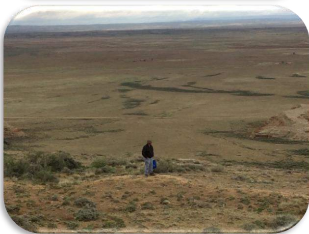
A nice scenic view from the ridge at the Turritella collecting area.