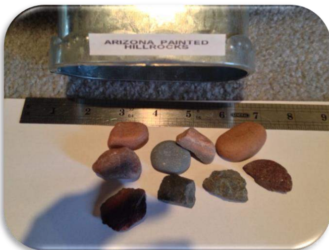
Above - Rocks from the painted hills in Arizona.