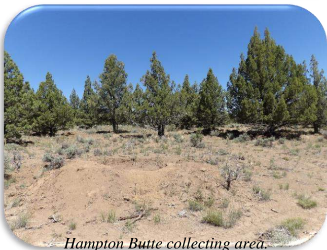
Hampton Butte collecting area.

hard-dry clay. I wouldn't say that it is hard rock mining, but it isn't far from it. We did manage to free up some material, but the color of the moss was mostly green. While we're at this location we took some time to enjoy the scenery. After about four hours of digging, we decided to head over to Hampton Butte. Hampton Butte is well-known for its petrified wood. After several miles of gravel backroads, we finally arrived around 4:30 pm. We decided to talk to a few rockhounds