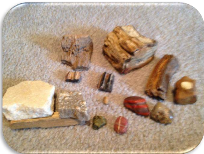
Above - Petrified wood. When mom collected it; I hated it. Now I love it, and it sits with respect on my hearth! Misc. rocks and petrified wood and petrified bone from a deer lease in Columbus, Texas, years ago.