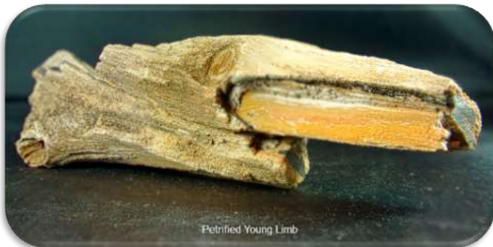
Petrified Young Limb

Petrified piece 1, is from the Piney Woods of East Texas. Sure, polishing could be attempted. But, LOOK at it. In its raw state, the texture of the bark and its knot holes are clearly visible, as are the layers beneath. The lands of East Texas are known to have been part of a shallow sea at a point in time. Petrified wood and fossils abound in the area. Most of the fossils there are known to be younger when compared to the geologic record. Choosing to forego polishing allows this piece to display what is: a relatively