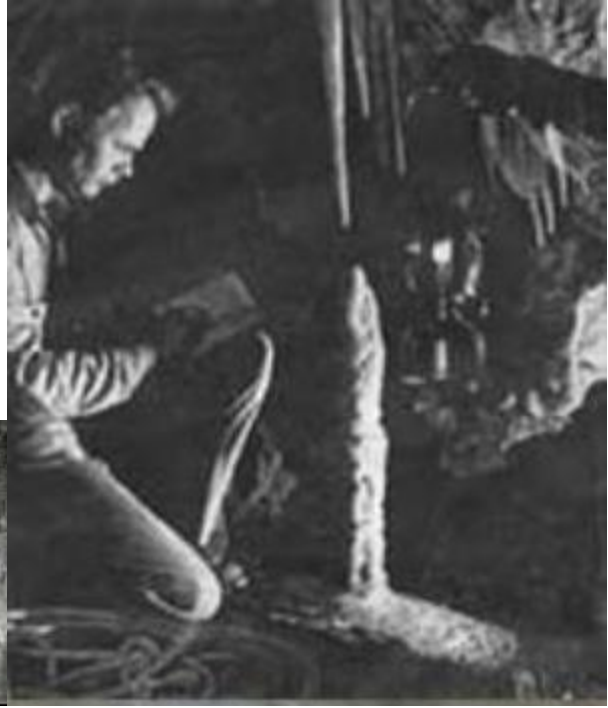
Oct. 1951 National Geographic