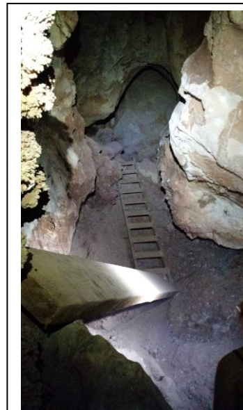
Ladder in a passage that was supposed to end. Cameron Kopus.