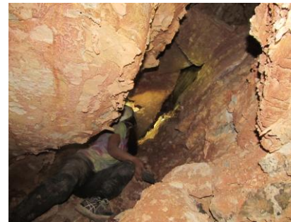
Ahn at end