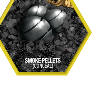
SMOKE PELLETS (CONCEAL)