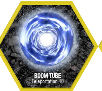
BOOM TUBE Teleportation 10