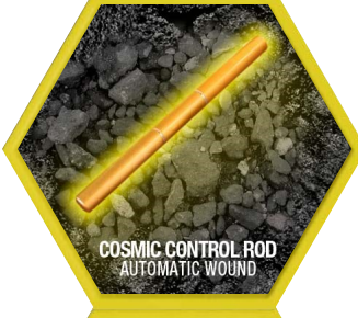
COSMIC CONTROL ROD AUTOMATIC WOUND