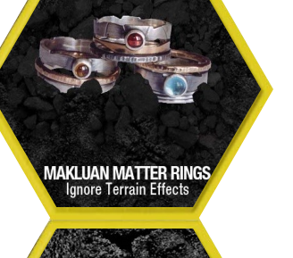
MAKLUAN MATTER RINGS Ignore Terrain Effects