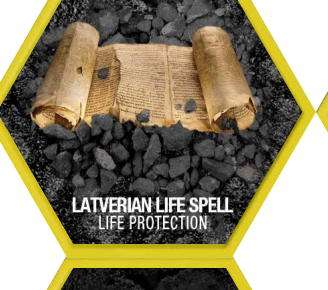
LATVERIAN LIFE SPELL LIFE PROTECTION