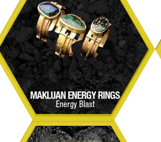
MAKLUAN ENERGY RINGS Energy Blast