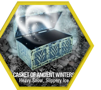
CASKET OF ANCIENT WINTERS Heavy Snow, Slippery Ice