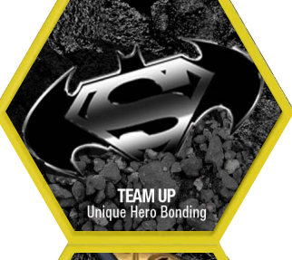
TEAM UP Unique Hero Bonding