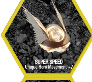
SUPER SPEED Unique Hero Movement +2