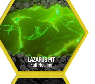
LAZARUS PIT Full Healing