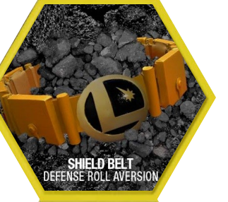
SHIELD BELT DEFENSE ROLL AVERSION