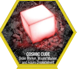
COSMIC CUBE Order Marker, Wound Marker, and Figure Displacement