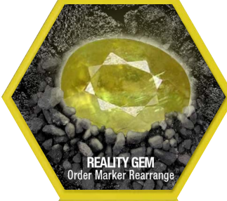
REALITY GEM Order Marker Rearrange