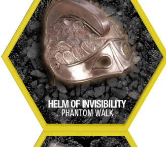
HELM OF INVISIBILITY PHANTOM WALK