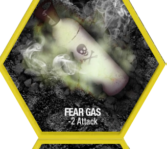
FEAR GAS -2 Attack