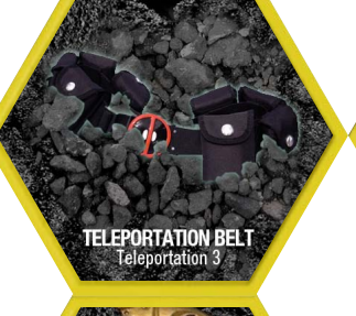
TELEPORTATION BELT Teleportation 3