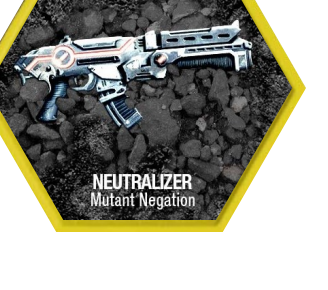
NEUTRALIZER Mutant Negation