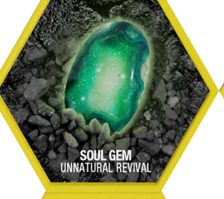
SOUL GEM UNNATURAL REVIVAL