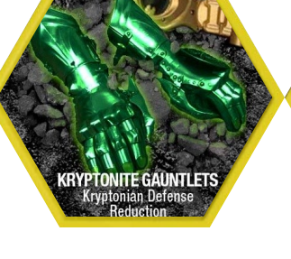
KRYPTONITE GAUNTLETS Kryptonian Defense Reduction