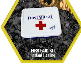
FIRST AID KIT Instant Healing