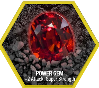
POWER GEM +2 Attack, Super Strength