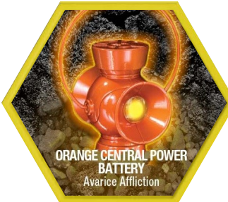
ORANGE CENTRAL POWER BATTERY Avarice Affliction