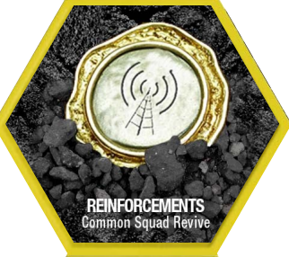
REINFORCEMENTS Common Squad Revive