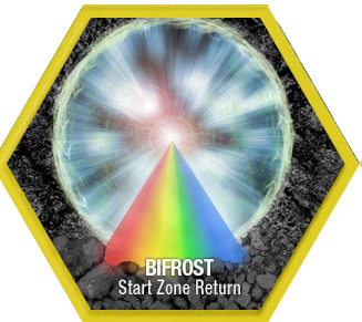
BIFROST Start Zone Return