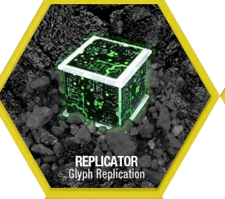
REPLICATOR Glyph Replication