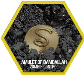
AMULET OF DAMBALLAH ZOMBIE CONTROL