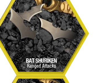
BAT SHURIKEN Ranged Attacks