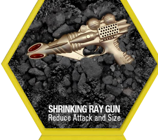
SHRINKING RAY GUN Reduce Attack and Size