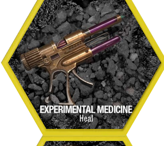
EXPERIMENTAL MEDICINE Heal