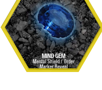
MIND GEM Mental Shield / Order Marker Reveal