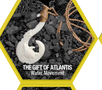
THE GIFT OF ATLANTIS Water Movement