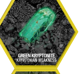
GREEN KRYPTONITE KRYPTONIAN WEAKNESS