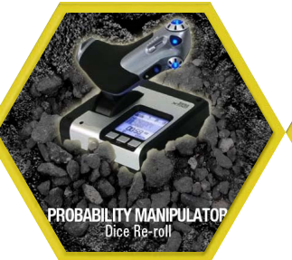
PROBABILITY MANIPULATOR Dice Re-roll