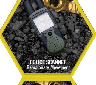
POLICE SCANNER Reactionary Movement