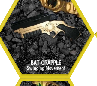
BAT-GRAPPLE Swinging Movement