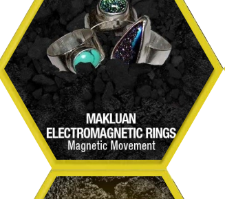
MAKLUAN ELECTROMAGNETIC RINGS Magnetic Movement