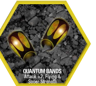
QUANTUM BANDS Attack +2, Flying & Super Strength