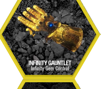
INFINITY GAUNTLET Infinity Gem Control