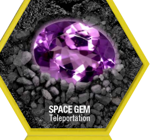
SPACE GEM Teleportation