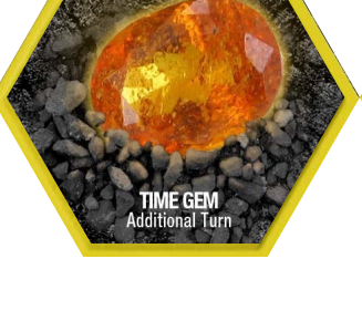
TIME GEM Additional Turn