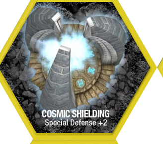
COSMIC SHIELDING Special Defense +2