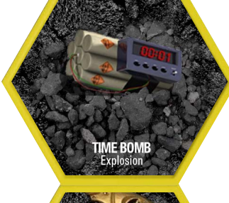
TIME BOMB Explosion