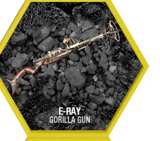
E-RAY GORILLA GUN