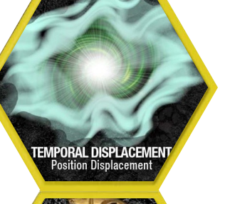
TEMPORAL DISPLACEMENT Position Displacement