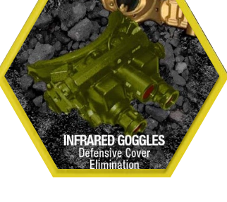
INFRARED GOGGLES Defensive Cover Elimination