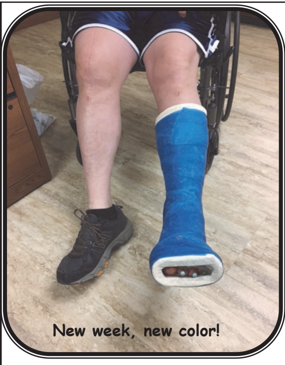
New week, new color!