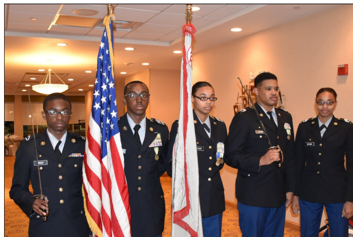
Woodrow Wilson High school 2017 JROTC Color Guard.

Once again, congratulations to these exceptional students and great examples of the youth of America! Best wishes for much success in their college and their military careers.