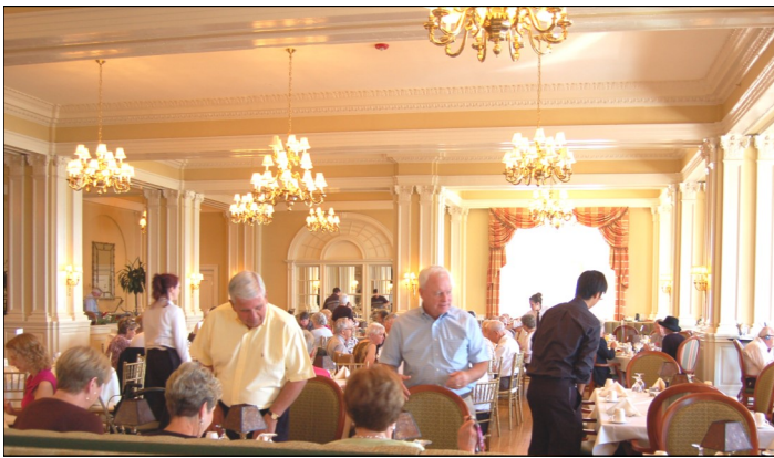
Above is the Chamberlin brunch venue.