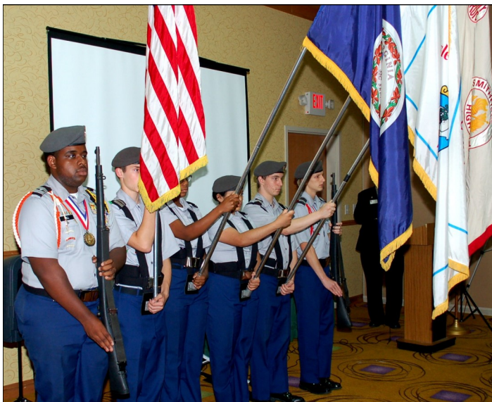
Above is the Smithfield High School Army JROTC Color Guard at our June dinner.