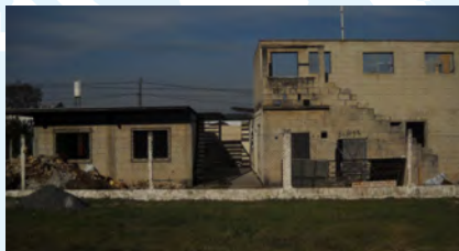
Former clinic to be new orphanage.

After many years of prayer and hard work, Destiny of Hope Children's Home is a reality. We finally have our building permit and can start remodeling the former clinic into our permanent children's home. Our advisory board collected bids from various contractors and narrowed them down to 3 possibilities. We interviewed the first one last week. Afterwards a board member suggested that we be our own contractor and hire out each building phase to various specialists. This would save us money, but it would take longer to complete the remodeling process. We would like to bring in teams of volunteers to do some demolition work before we start remodeling. Once the main structure is completed we will need more volunteers to help with the finishing touches. Please ask the Lord if He would have you be a part of the construction process, either physically or monetarily.