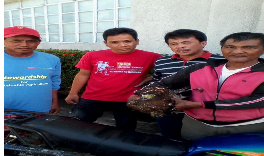
Surrendered captured Wild life