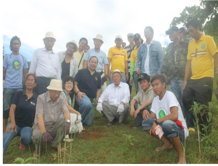
Tree Planting with OISCA-CHILDREN FOREST PROGRAM