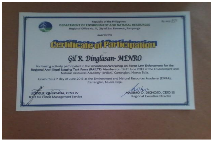
#7, Seminar on Law Enforcement for Anti-Illegal Logging TF members