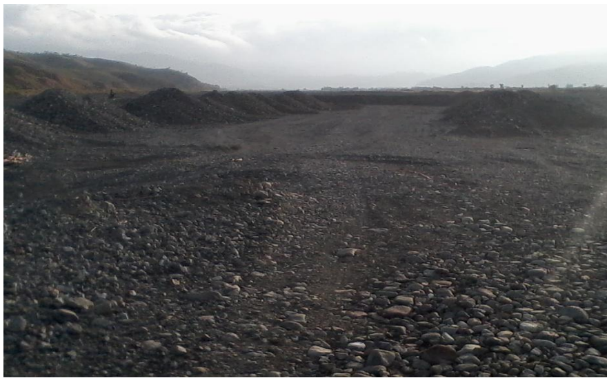
#5, Inspection of Possible Quarry Site