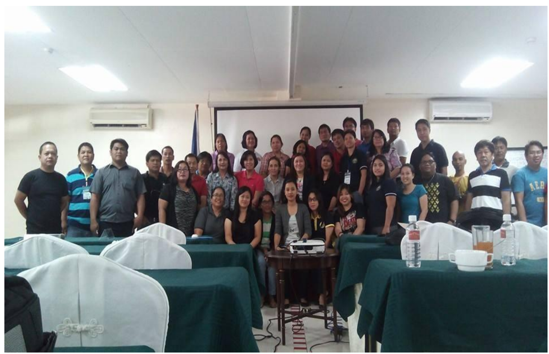
Write shop on 10-Year Solid Waste Management Plan