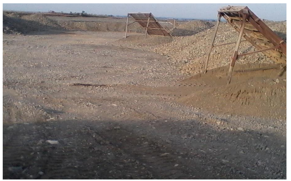
# 2. Quarry Operations