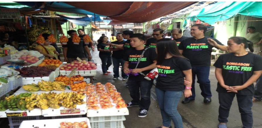
Monitoring of Plastic Free Bongabon