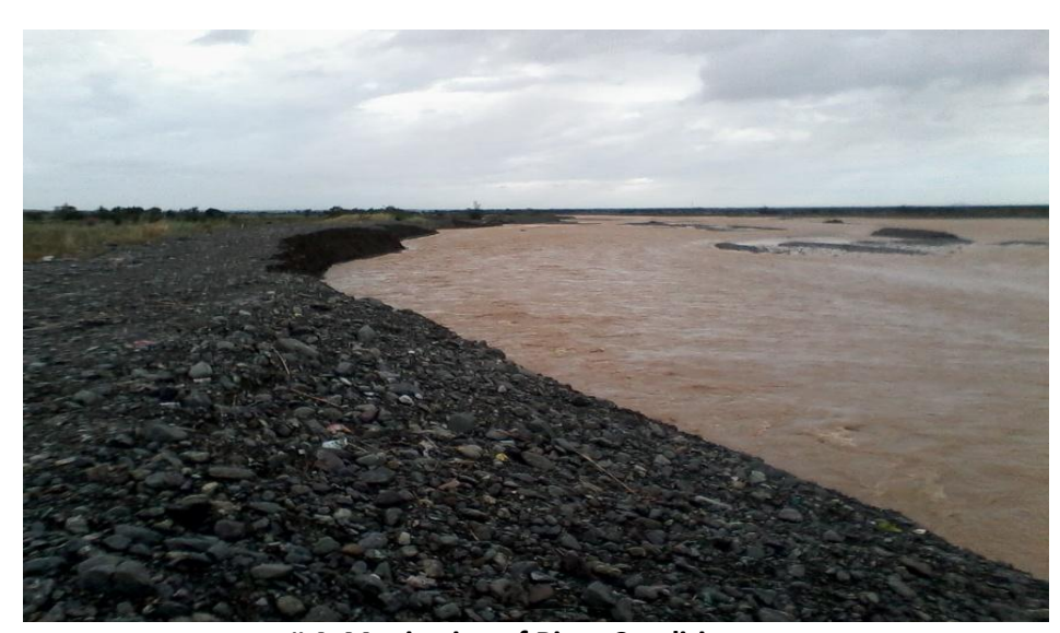
#4, Monitoring of River Condition