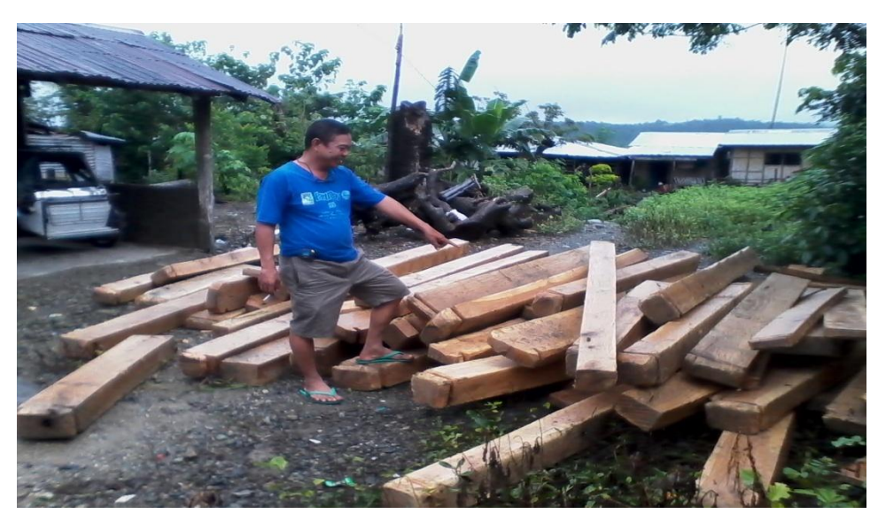
#8, E.O. no. 23, Apprehension of Illegal Logs