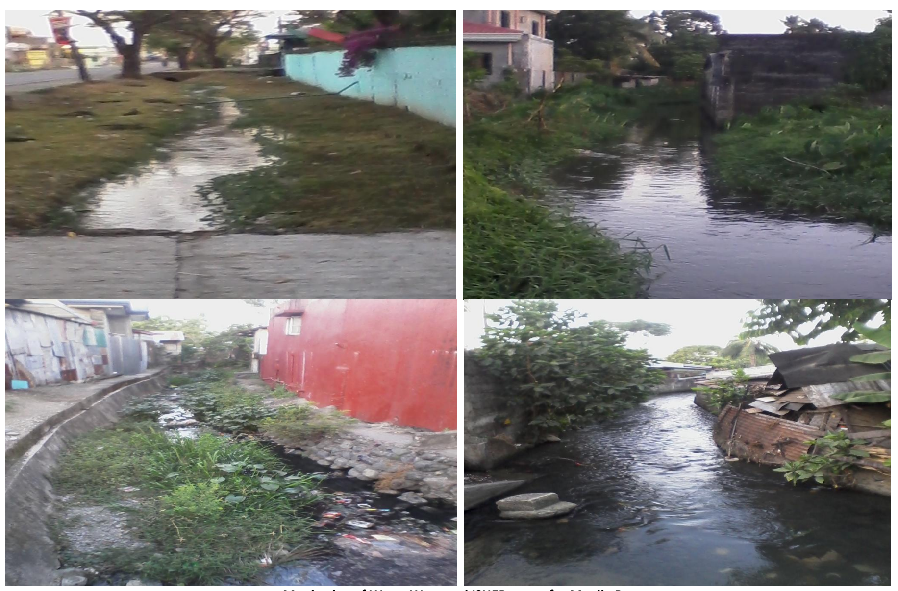
Monitoring of Water Ways and ISHER status for Manila Bay