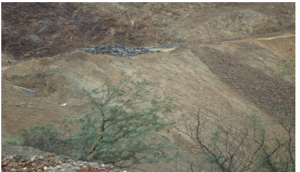
# 6, Quarrying and Road Construction in Brgy Labi