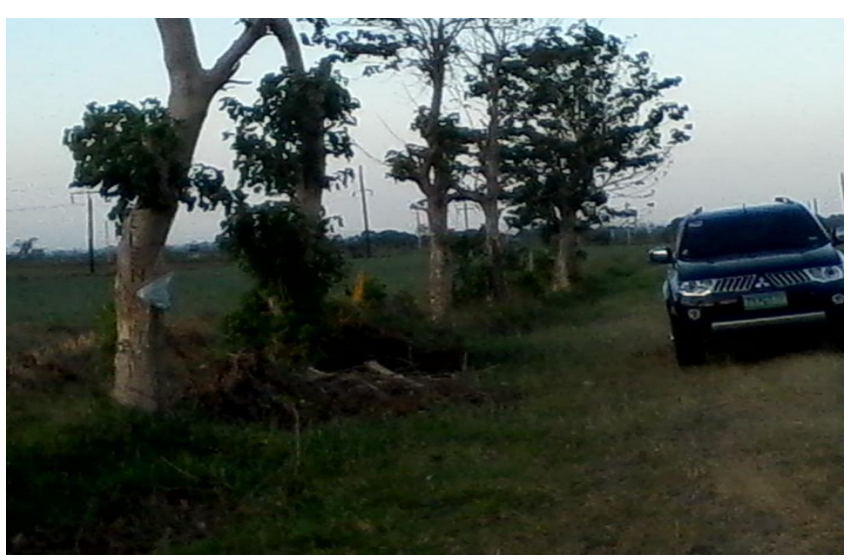
#9, Inspection of Trees requested for cutting