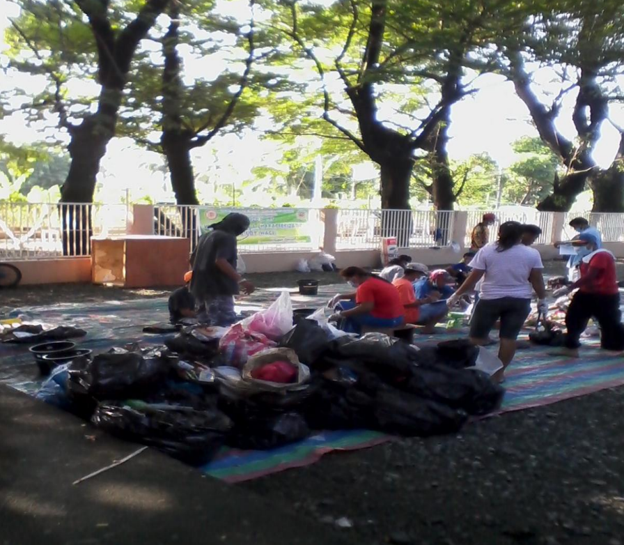
Conduct of Waste Analysis and Characterization Study