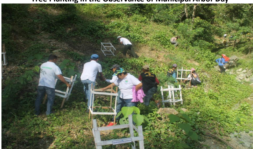
June 25, National Arbor Day