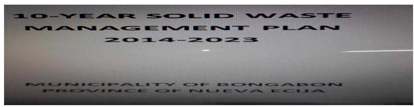
Final Draft of 10-Year Solid Waste Management Plan