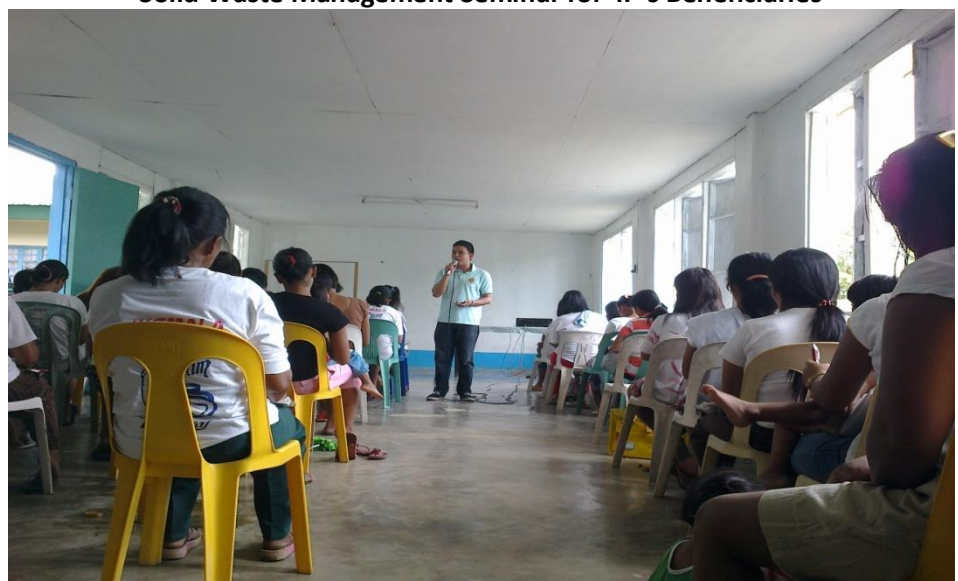
Youth Summit (Role of Youth in the protection of Environment)