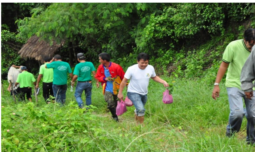
Observance of Save Sierra Madre Day