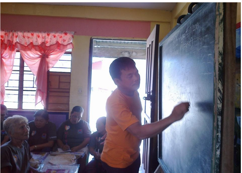
Solid Waste Management Seminar for 4P's Beneficiaries