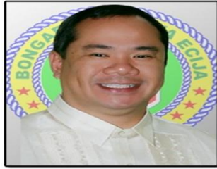
ALLAN XYSTUS A. GAMILLA Municipal Mayor