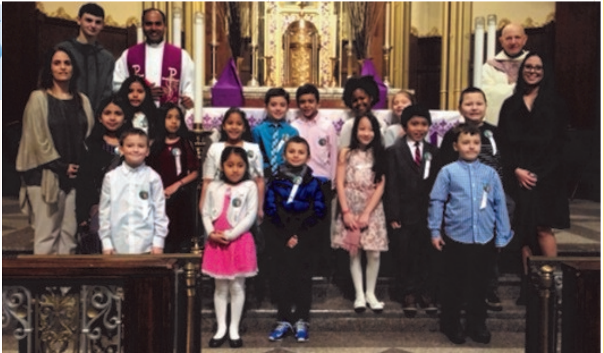
We received First Penance on Saturday, March 17th