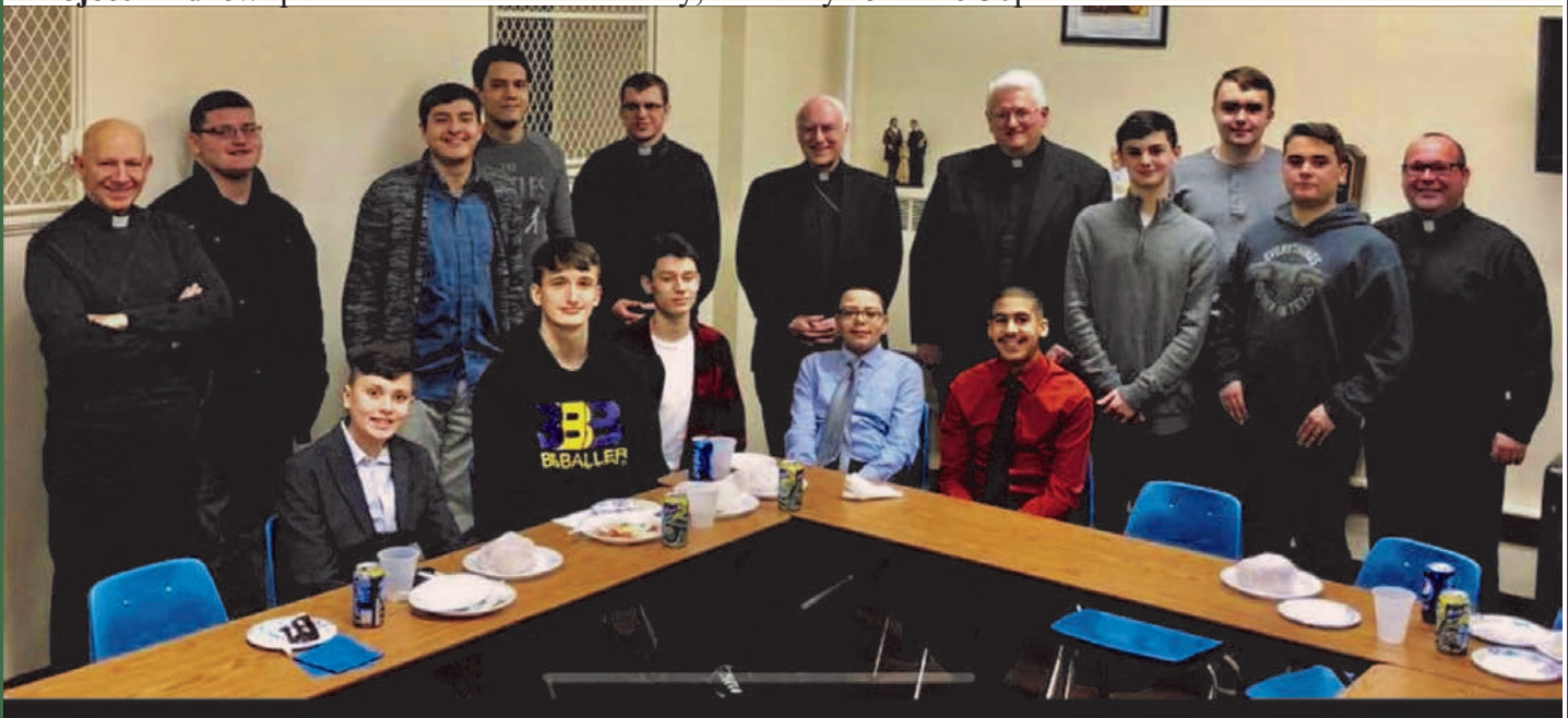
Project Andrew: photo below taken on Sunday, February 25th at 6:30pm