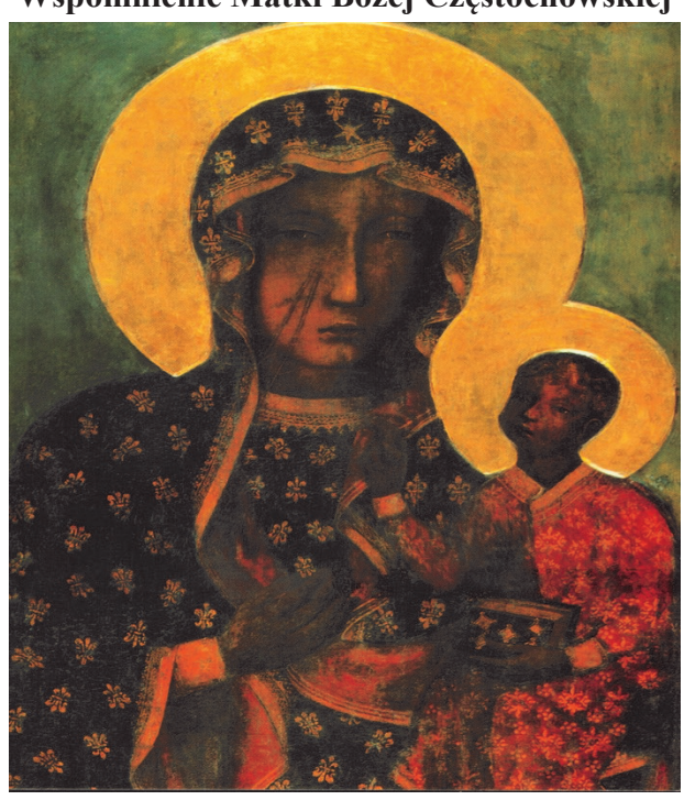
26 sierpnia poniedziałek godz. 7:00pm Zapraszam!