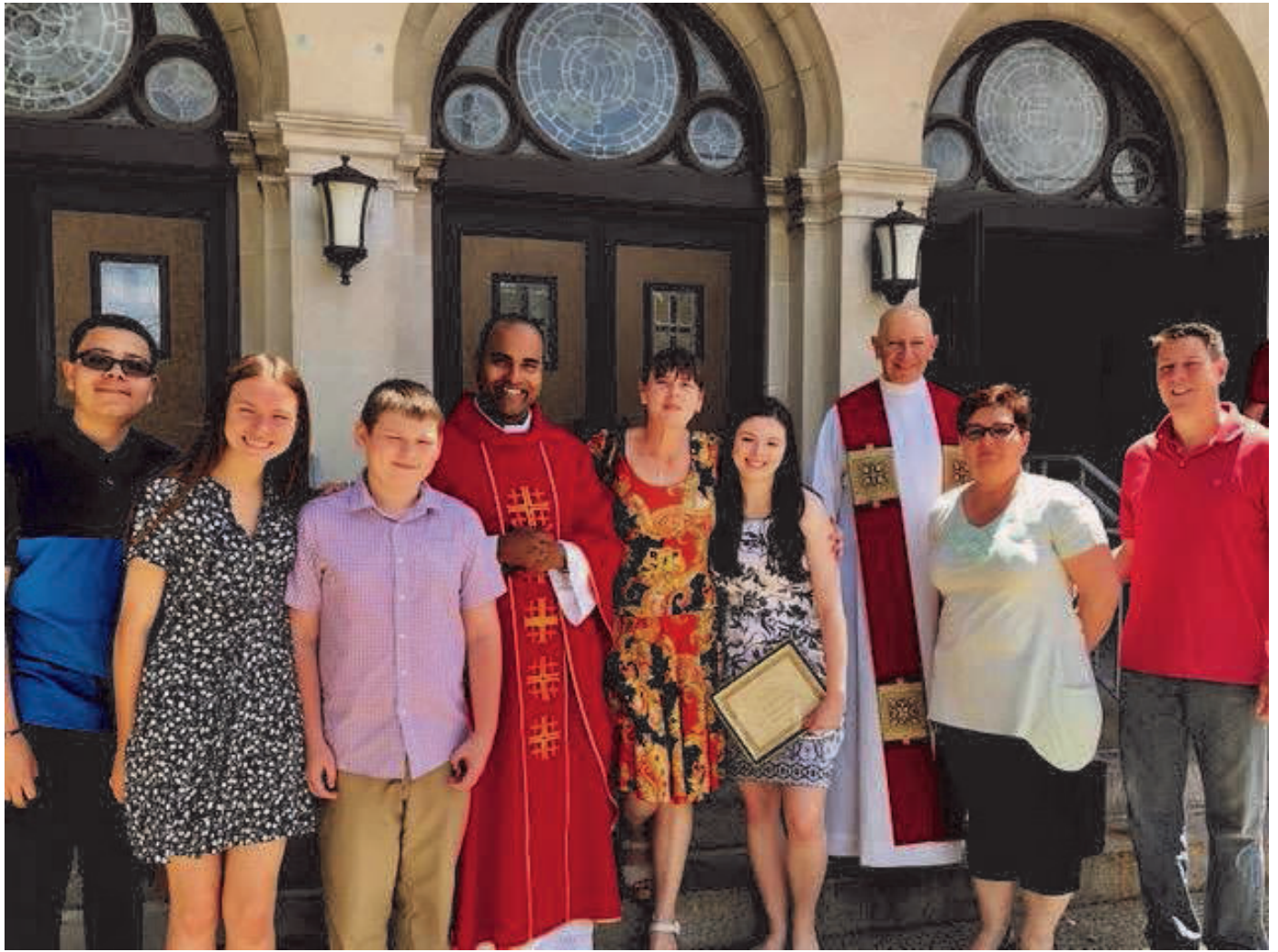
Pentecost Sunday Sunday, June 9th