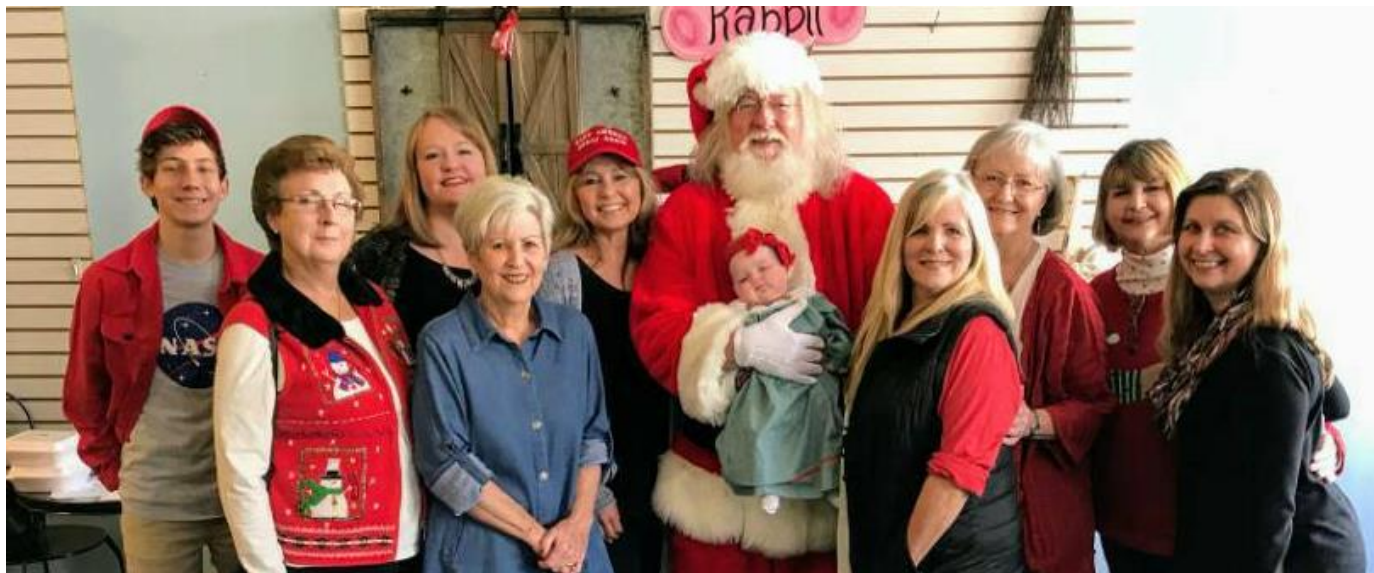
Santa's helpers at the Three Earred Rabbit!