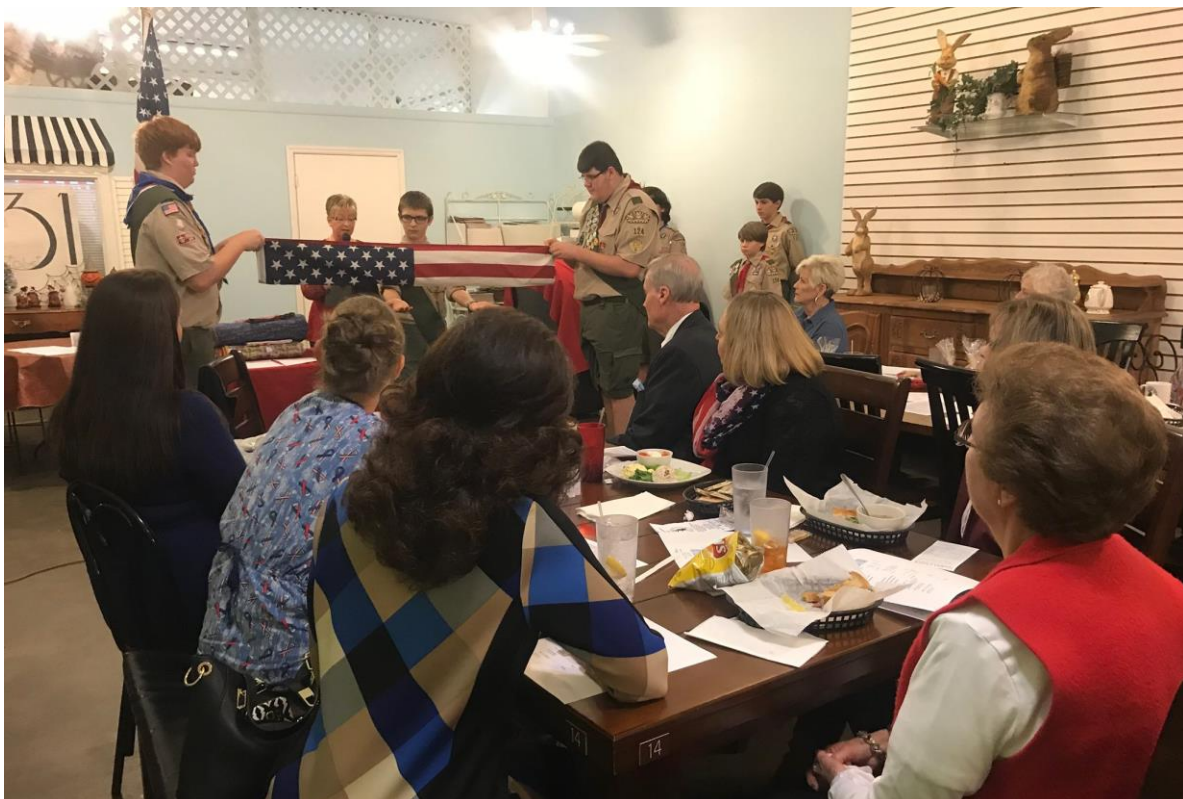
The Boy Scout Troop 124 presenting the meaning of each fold of the American Flag. Each fold has such a special meaning.