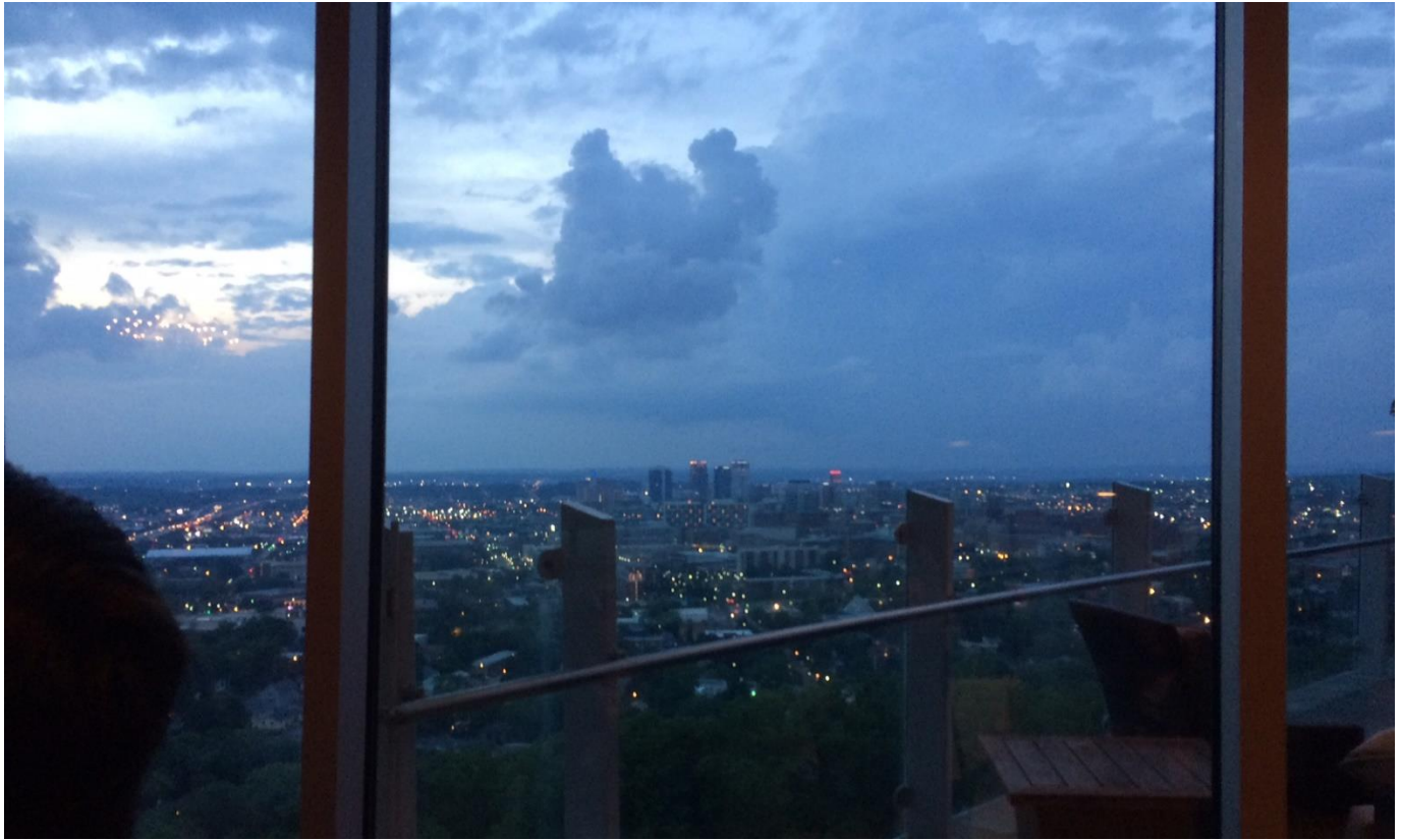
Looking out the window at The Club