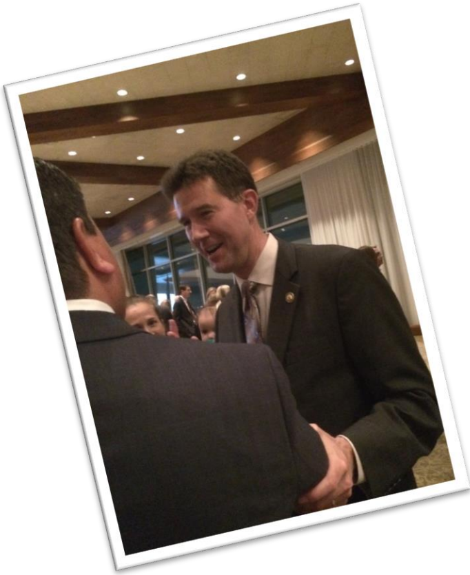
Here is a clue, he is in Montgomery _____