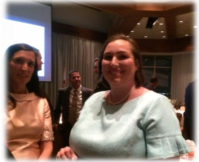
Another clue, she is President of an AFRW club.